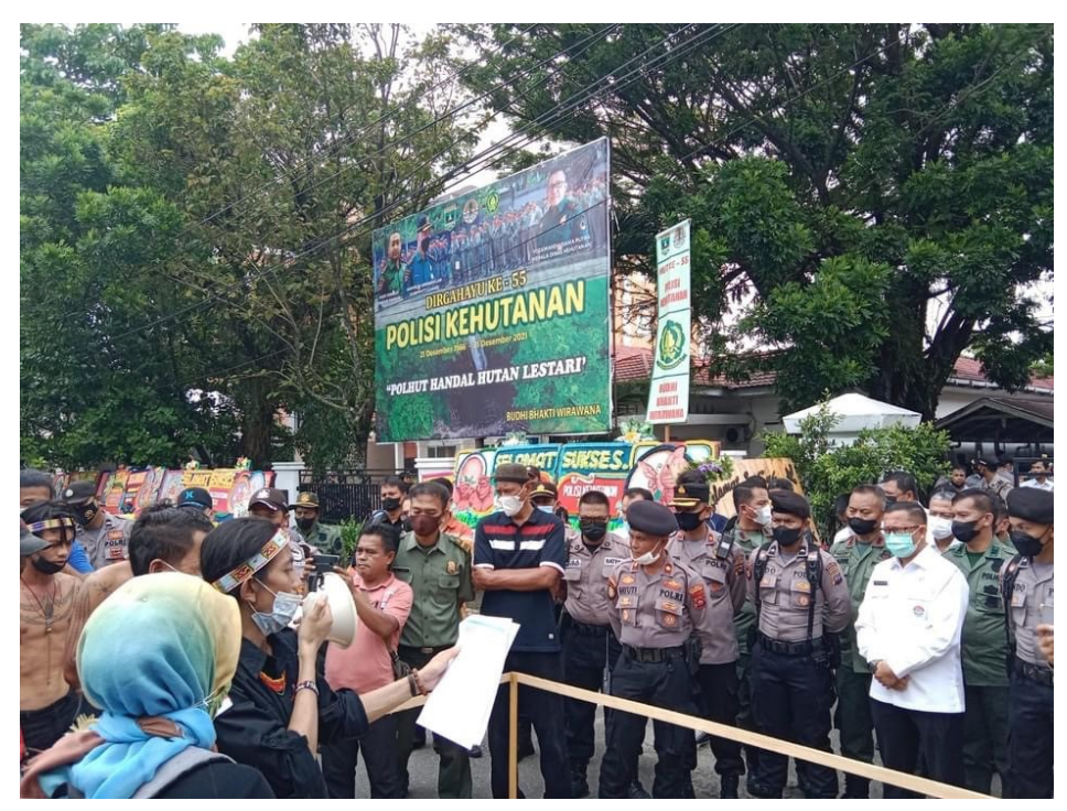
Figure 6. Protest 22 December 2021 in front of forestry department office in Padang (FORMMA 2021)

need for additional regional revenue through timber production.