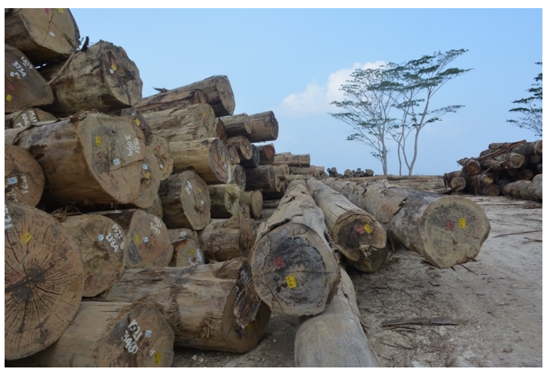
Figure 3. MPLC log pond in North Pagai (Tulius 2015)

The appearance of the forests on Siberut after 20 years of commercial logging differed slightly from Sipora and the Pagai Islands. While the southern islands had cleared entirely, the logged-over area on Siberut had comparatively substantial sections of