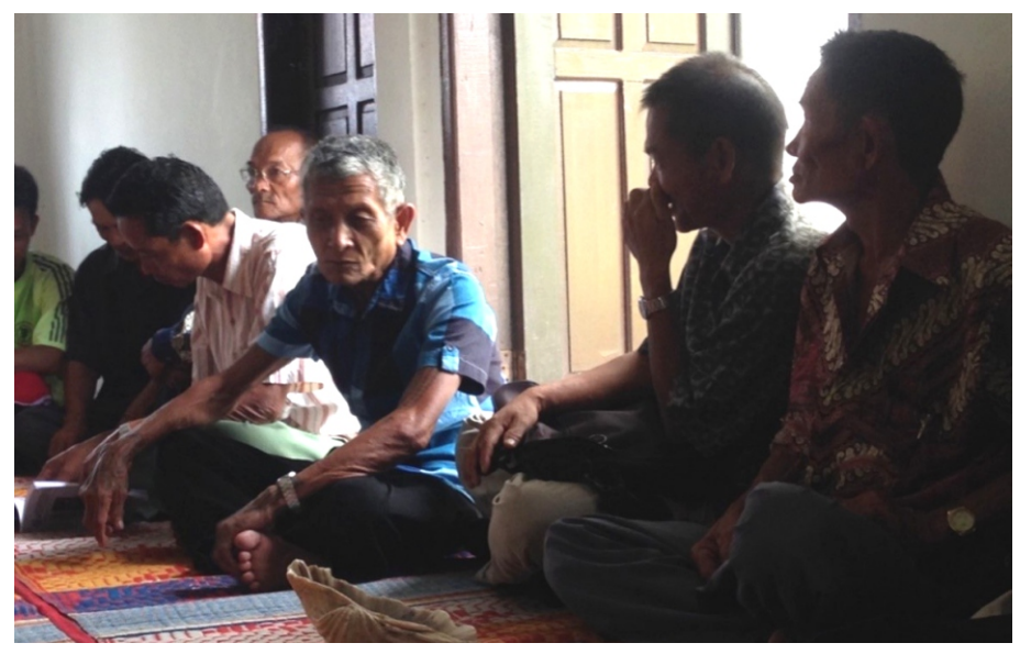
Figure 2. Focus group discussion with local communities during fieldwork on Siberut Island (Tulius 2014)

observation and focused on reflections and data provided by online communities. Netnography was a research method to investigate communities and cultures by analyzing data from online sources, such as forums, social media, and blogs (Kozinets 2015; Costello et al. 2017).