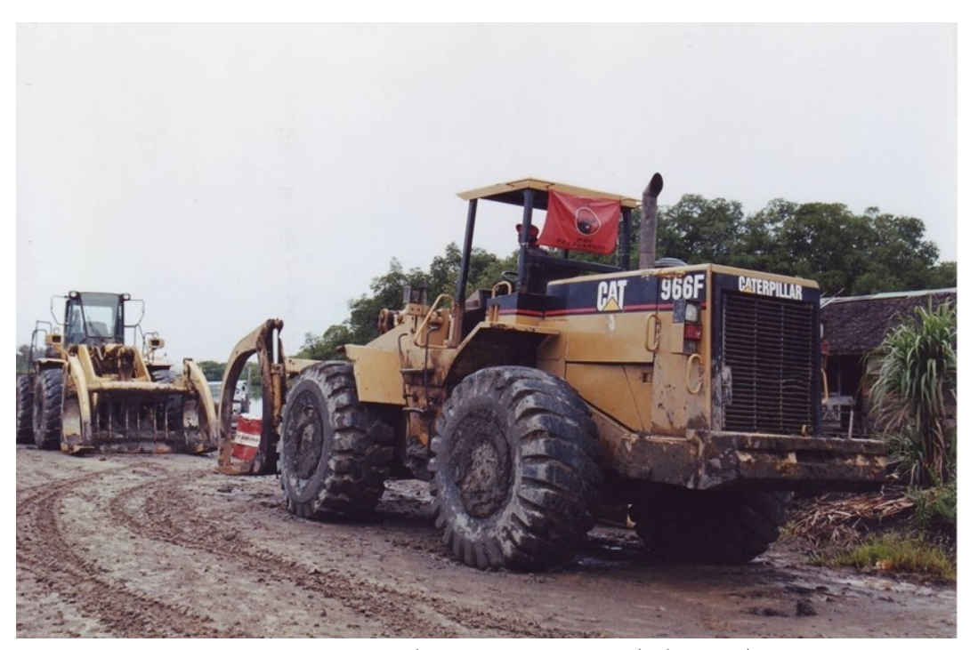
Figure 4. Heavy machinery KAM Base camp (Tulius 2002)

vehemently opposed to KAM's presence. The egalitarian structure of the clan allowed no one to speak on behalf of the brother or the clan (Schefold 1988; Tulius 2012). However, some individuals kept making appointments with KAM in their personal capacity and interest, regardless of this social code.