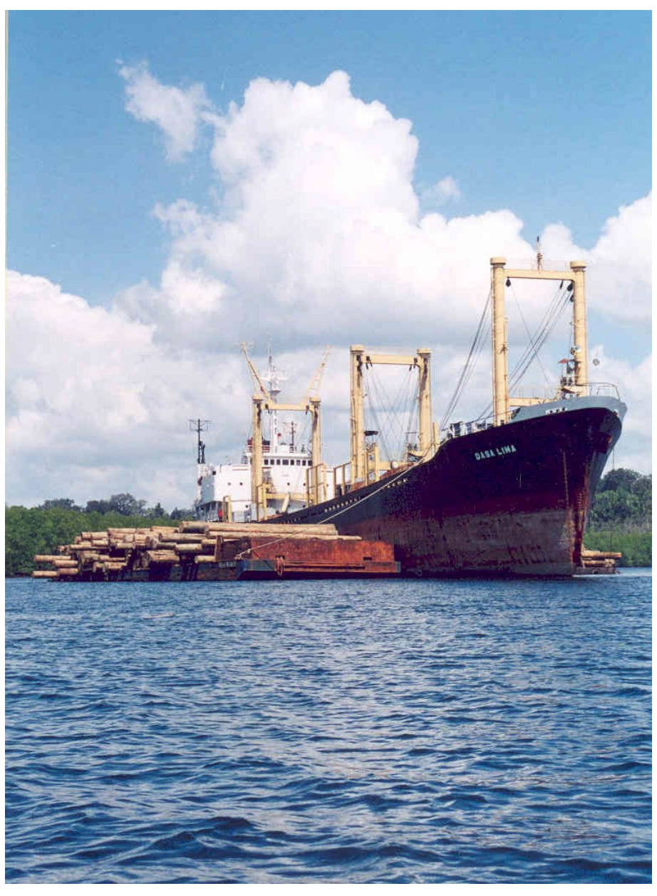
Figure 5. Logs from KAM concession loaded for international transport (Eindhoven 2005)

ted on Siberut from the 1970s until 1992. In 2001, it operated under the name PT. Salaki Summa Sejahtera (PT. SSS) secured a preliminary permit for a logging concession spanning 49,440 ha. Local communities and NGOs raised objections, challenging the conducted environmental impact assessment and the circumvention of the local government. These protests led to the suspension of the permit for nearly two years. Under mounting pressure from an international lobby led by UNESCO and Conservation International Indonesia (CII), the Ministry of Forestry rescinded the permit in May 2003. However, the Mentawai Regency government reinstated the permit in December 2003 due to indications expressing the