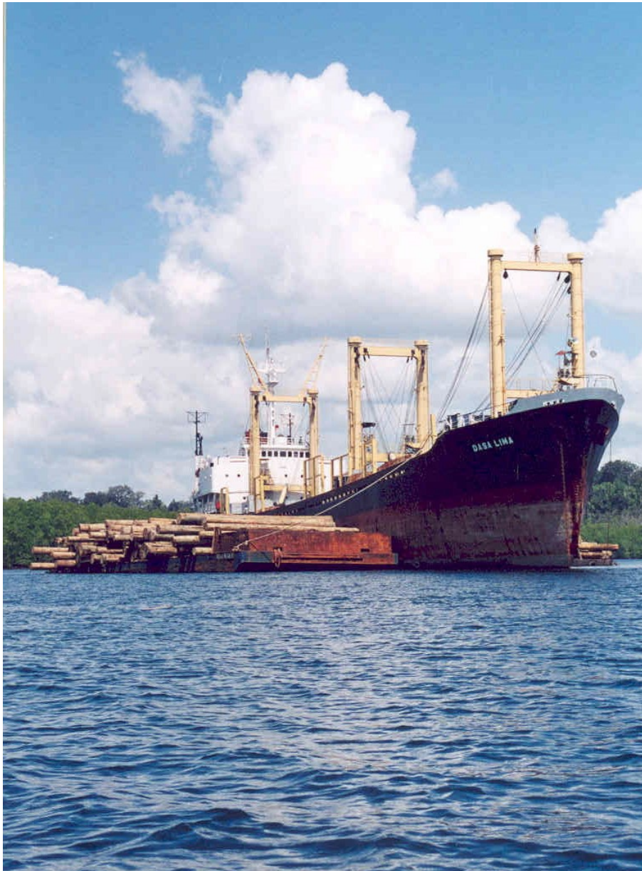
Figure 5. Logs from KAM concession loaded for international transport (Eindhoven 2005)

ted on Siberut from the 1970s until 1992. In 2001, it operated under the name PT. Salaki Summa Sejahtera (PT. SSS) secured a preliminary permit for a logging concession spanning 49,440 ha. Local communities and NGOs raised objections, challenging the conducted environmental impact assessment and the circumvention of the local government. These protests led to the suspension of the permit for nearly two years. Under mounting pressure from an international lobby led by UNESCO and Conservation International Indonesia (CII), the Ministry of Forestry rescinded the permit in May 2003. However, the Mentawai Regency government reinstated the permit in December 2003 due to indications expressing the