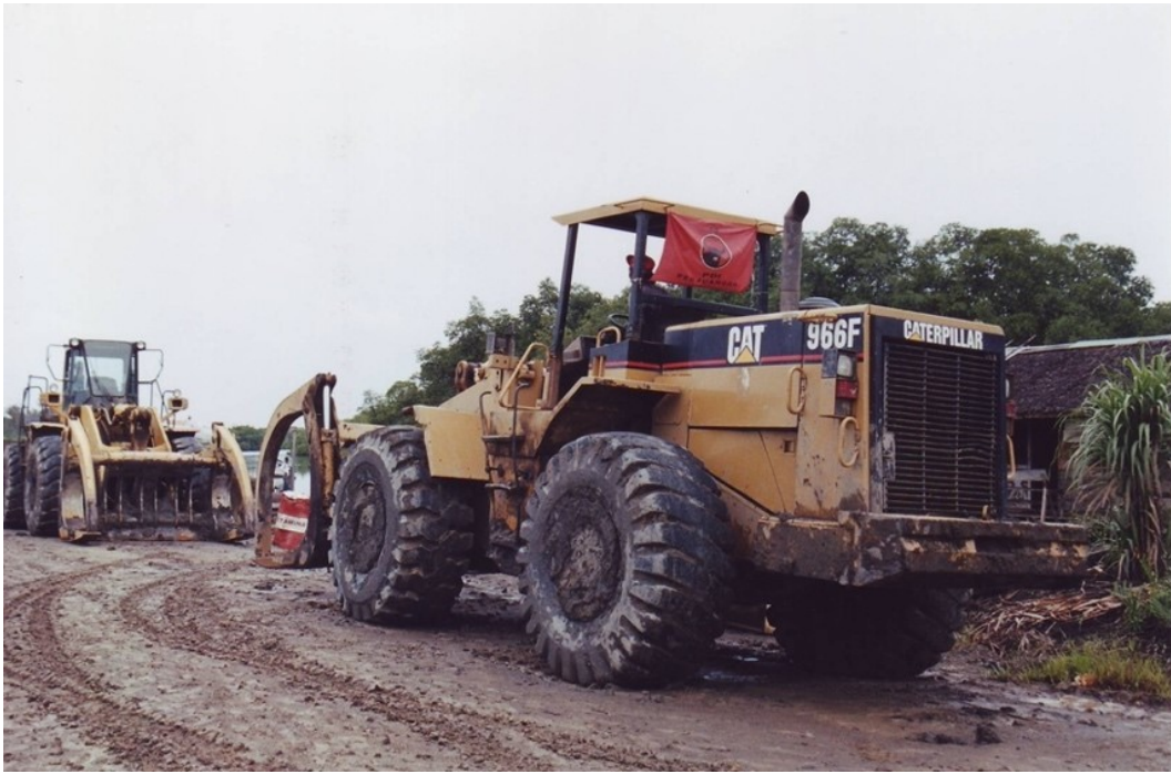
Figure 4. Heavy machinery KAM Base camp (Tulius 2002)

vehemently opposed to KAM's presence. The egalitarian structure of the clan allowed no one to speak on behalf of the brother or the clan (Schefold 1988; Tulius 2012). However, some individuals kept making appointments with KAM in their personal capacity and interest, regardless of this social code.