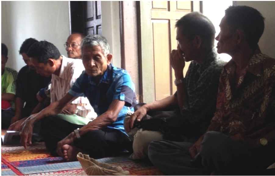
Figure 2. Focus group discussion with local communities during fieldwork on Siberut Island (Tulius 2014)

observation and focused on reflections and data provided by online communities. Netnography was a research method to investigate communities and cultures by analyzing data from online sources, such as forums, social media, and blogs (Kozinets 2015; Costello et al. 2017).