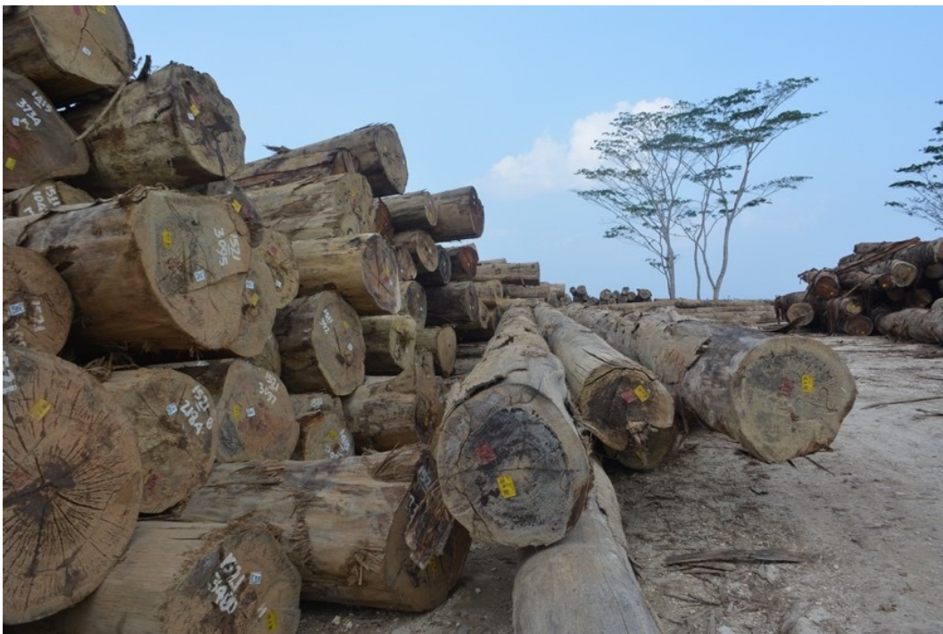
Figure 3. MPLC log pond in North Pagai (Tulius 2015)

The appearance of the forests on Siberut after 20 years of commercial logging differed slightly from Sipora and the Pagai Islands. While the southern islands had cleared entirely, the logged-over area on Siberut had comparatively substantial sections of