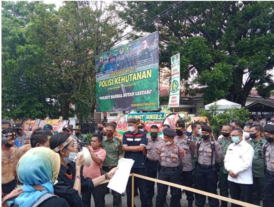
Figure 6. Protest 22 December 2021 in front of forestry department office in Padang (FORMMA 2021)

need for additional regional revenue through timber production.