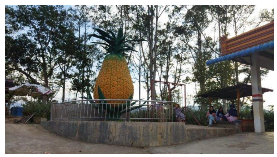
Figure 2. Parhonasan Daihonas

Perception of visitors to the quality of agrotourism