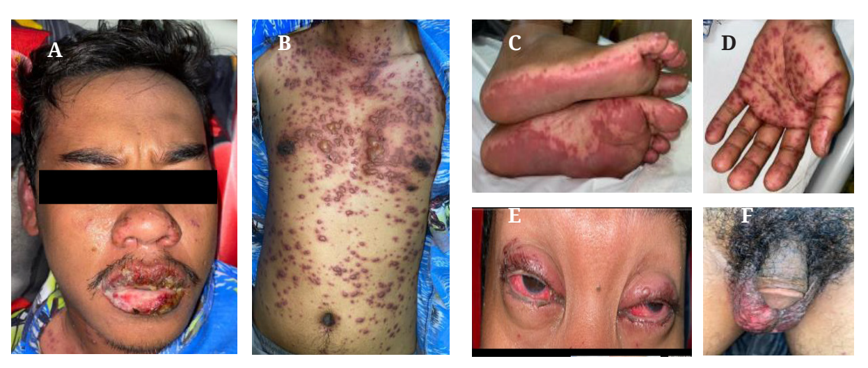
FIGURE 1. Clinical features of the patient showed erythematous rash, bullae, and erosion appearing on lips (A), trunk (B), extremities (C and D), conjunctivitis (E), and genitalia (F).

Laboratory tests showed elevated AST and ALT levels, increasing from baseline values of 48 U/L and 25 U/L to 64 U/L and 104 U/L, respectively. Additionally, the patient had a decreased CD_4 cell count of 255 cells/mm<sup>3</sup>. He was diagnosed with SJS overlapping toxic epidermal necrolysis (TEN) induced by nevirapine, in the context of HIV stage 3 with oroesophageal candidiasis.