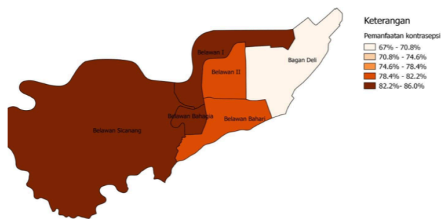
Figure 1. Benefit of Contraception

Based on the picture below, it is known that Belawan Sicanang, Belawan I, and Belawan Bahagia Sub-districts feel the benefits of using contraception and become the most contraceptive users in Medan Belawan District by 82.2%-86%. Meanwhile, Belawan II and Belawan Bahari Villages 78.4%-82.2% and Bagan Deli Villages felt that there were benefits from using contraception by 67%-70.8%.