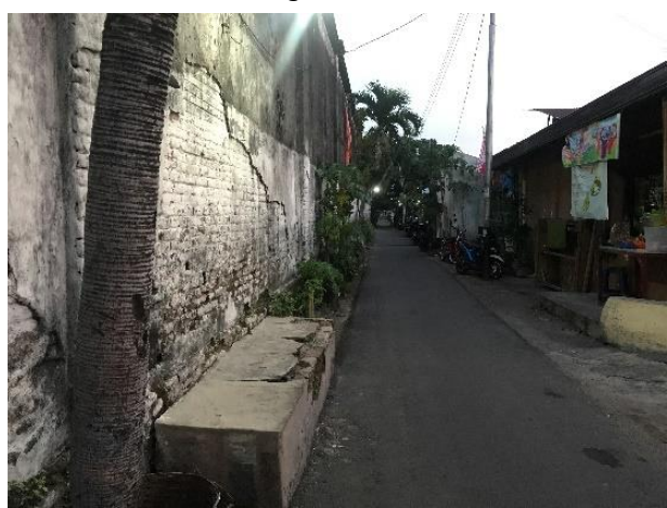
Figure 5. Street along the Beteng Kraton

The residents often use it along the road as a place for joint activities such as chatting, parenting, or buying and selling. Lengthwise public open spaces such as this road can be classified as linear patterns. The same is the case with " buk " or places to sit along the road. Or like the one in Kampung Mloyokusuman, which is open space along the walls of the Palace Beteng.