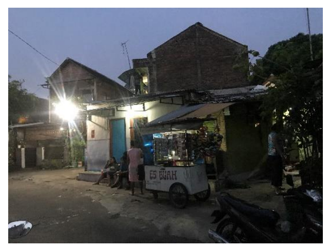
Figure 7. Area near Pos Ronda

This pattern is found in several public open spaces in urban kampung s. This pattern is usually marked by the presence of the main object such as a pos ronda or security pos, mosque, or wedangan where the surrounding area used by the residents as open space.