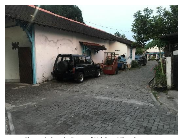
Figure 6. Area in Front of Ndalem Mloyokusuman

Public open spaces that have a cluster pattern can be seen in the front area of the Ndalem Mloyokusuman gate where the public open space is utilized by residents that surrounded by gates and other houses.