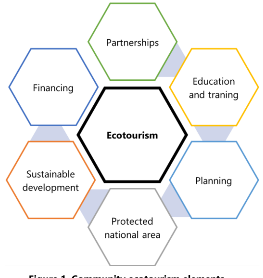
Figure 1. Community ecotourism elements

The fundamental objective of ecotourism is to conserve and implement the sustainability of natural resources. Also, help develop the economy of the local people. However, achieving ecotourism goals will depend on whether these are environmentally and ecologically sustainable. Besides, cooperative tourism planning is needed to achieve these goals. The Figure below shows the elements needed to ensure the community is involved in ecotourism development (Drumm & Moore, 2005).