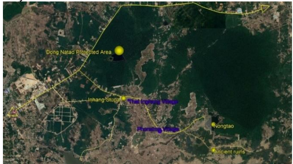
Figure 3. Map of tourist attraction of Phonsim village and That Inghang village

Phonsim and That Inghang villages are located of four attractions, includes 1) Dong Natad Provincial Protected area, 2) Inghang Stupa, 3) Turtle Lake and 4) Ancient ruins. This is the reason that why this location was chosen as a study location.