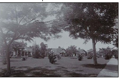
Figure 2. Brawijaya Field as Regional Square

The nodes of the factory area which became a strategic area in 1947 were the Adirasa field and the East Brawijaya field. Adira field is the widest open space in the factory area and is used as a gathering place for factory workers. While the East Brawijaya field is used as a park for European staff settlements that surround the park.