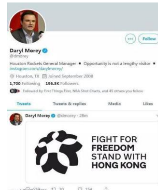
Image 2. Morey personal tweet about supporting Hong Kong Protest

Daryl Morey is a former general manager of the Houston Rockets in the United States. Morey caused a sensation in October 2019 when he tweeted his support for Hong Kong pro-democracy activists. The tweet, which included a photo with the words "Fight for Freedom, Stand with Hong Kong," The post referenced the Hong Kong protest movement, which angered Chinese fans. Morey deleted it shortly after. But it already prompted uproar in China, where the government and many people saw it as an attack on their "sovereignty" and support for separatists.