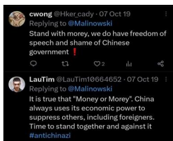
Image 16 & 17. Pictures of pro and contra comment toward Morey's tweet from.

All of this shows how people are "attracted" to this fight. Morey's tweet was praised by people involved in the pro-democracy movement in Hong Kong as a sign of freedom of speech and human rights. While Chinese nationalists and people who support the Chinese government were critical of him and the NBA because they saw that Morey's tweet threatened Chinese sovereignty, those fans from both countries were actively exchanging opinions and words in social media.