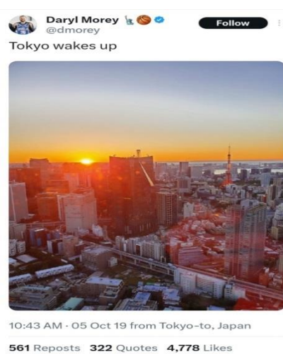
Image 12. Morey's tweeted picture about Japan

be inferred from a comment made on a tweet by Daryl Morey that is unrelated to the controversy. Fans shared their thoughts, and when they were furious or frustrated, they frequently expressed it through the use of harsh language. Morey's personal Twitter account (@dmorey) became "crowded," with many Chinese and Americans arguing about the controversy he had created. For example, Morey tweeted a picture in Japan a day after the viral tweet, got 898 retweets and 8k likes, and exploded the comment section with more than 10k comments that mostly come from US and Chinese netizens commenting about the issue.