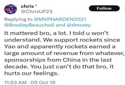
Image 13. Comment about Morey's conflict on Morey's personal twitter account by @ChrisUF23

many comments regarding this issue. Chinese fans were angry about Morey's tweet because it was a clear threat to China's sovereignty and an endorsement of the Hong Kong protests, which the Chinese government was strongly against. They thought it was a sign of support for the protests in Hong Kong, which Morey had already said he agreed with. Fans in China thought Morey had violated their trust and loyalty and degraded Yao Ming's legacy and reputation when he tweeted in support of the Hong Kong protests. They also believed he had damaged the NBA's connection with China, one of its biggest and most profitable markets. It made them even angrier since the NBA is a respected organization in China. For example: