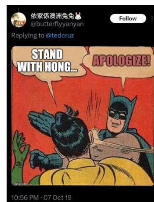
Image 18 & 19. Memes criticizing NBA during the Daryl Morey's conflict

The fans then have their creative way to protest it. Fans on social media are also protesting by using memes to mock the NBA's decision that triggered public sentiment. Memes have become a tool for NBA fans to express their dissatisfaction with how the NBA handles conflicts. These fans use memes as a means of protest. Some fans believe that the NBA prioritizes apologizing and pleasing China for expressing opinions that are not mistakes.