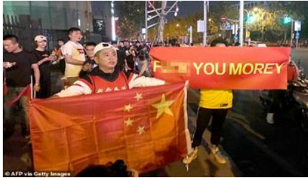
Image 14. A photo about Chinese fans Protest toward Morey.