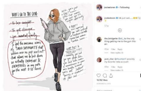
Figure 6. A Woman Who Feels Superior After Exercising. Houts, J. [@jooleeloren]. (2018, November 4). Idk just sad..... [woman in lotus position emoji] [Photograph]. Instagram. https://www.instagram.com/p/BpusmwGnFqx/

enhance her strength, or get “mental clarity” (Houts, 2018).