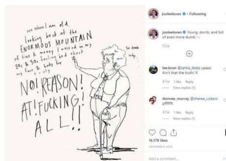
Figure 4. An Older Woman Questioning Beauty Products She Used in Her Youth. Houts, J. [@jooleeloren]. (2018, December 6). Young, dumb, and full of even more dumb [Photograph]. Instagram. https://www.instagram.com/p/BrBSw93Htg2/

Women often perceive the process of aging as something they must avoid. Women fear looking old as it can deprive them of vital resources. This fear stands out even more when considering that older women often get unfair treatment due to their aging appearance. The fear of looking old then drives women to preserve their youthful appearance or conceal their age using anti-aging products. However, this study found that aging is inevitable and anti-aging products are hardly effective in stopping the aging process. Figure 4. captures this reality.