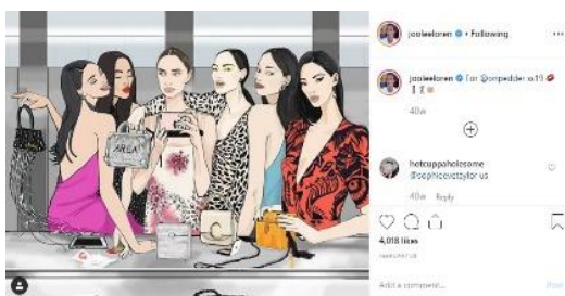
Figure 1. A Depiction of Thin Women in an Advertisement for On Pedder.

standard of women's ideal body. The three aspects that comprise women's ideal body are discussed one by one. In terms of thinness, there is a clear preference for women with thin bodies. The preference for thin women over fat women is prevalent in advertisements. In advertisements, thin women tend to appear more frequently than fat women. The preference for thin women is evident in Figure 1.