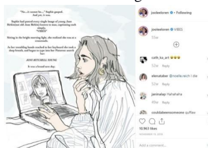
Figure 3. A Woman’s Obsession with Female Celebrities’ Youthful Appearance. Houts, J. [@jooleeloren]. (2018, November 15). VIBES [Photograph]. Instagram https://www.instagram.com/p/BqLR7KmnroZ/

invisibility and exclusion of older women. The invisibility and exclusion that older women experience are evident in Figure 3.