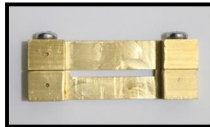
Figure 1. Brass mould

Three group test samples for the flexural strength test were prepared. Each group contained