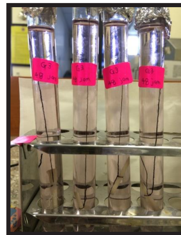
Figure 2. Treatment FRC samples in mouthwash

four samples. In line with ISO 10477:92, samples were prepared with the brass mold as in Figure 1. The polyethylene fibers were kept in desiccators for 24 hours to avoid its exposure to moisture from the atmosphere. The polyethylene fibers were cut into strips for 25 mm long to accommodate for the adaptation into the brass mold.