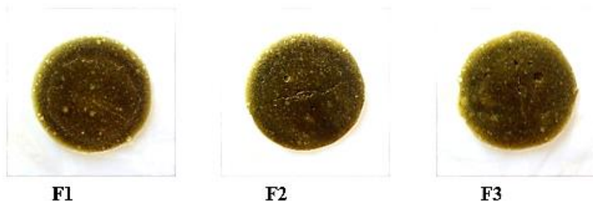
Figure 2. Results of Organoleptics of patch of Celery Herb Ethanolic Extract with polymers combination of HPMC: CMC-Na with ratio of 3 : 1 (F1); 1:1 (F2); and 1:3 (F3)

each patch formula decreases during storage. Formula 3 has the highest thickness value compared to formulas 1 and 2 ( F3 > F2 > F1 ). The high concentration of CMC-Na will produce a thicker patch matrix because CMC-Na is hygroscopic, whereas HPMC polymers will produce a thinner patch matrix (Kurniawati, 2016). Paired Samples T-Test showed that thickness of each patch formula during storage resulted in sig F1, F2, and F3 values respectively are 0.004; 0,001; and 0.006. The results of the analysis show the thickness of each formula during storage there was a significant difference (sig < 0.05 ). One Way Anova test between patch formulas obtained sig value of 0,000 which indicates the thickness of the three formulas there is a significant difference because sig < 0.05 . Post Hoc test results are known to the group that gives an average difference in thickness value is formula. The analysis results show that the variation of the ratio of HPMC and CMC-Na polymers on the ethanol extract of celery herb patches affects the thickness of the patch, which is increasingly the concentration of CMC-Na polymers compared to HPMC polymers will increase thicker of patch.