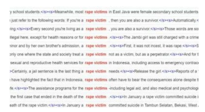
Figure 2. Examples of clauses containing the phrase rape victim

highlighting teenagers and secondary school students. This portrayal reveals a concerning pattern that underscores the vulnerability of the youngest members of society. Despite their vulnerability, there is a noticeable effort to portray victims as strong and resilient individuals, with news articles strategically utilizing quotations to present diverse perspectives (see Figure 2 for examples of clauses containing the phrase "rape victim"). The chapter also critically addresses the inadequacies of sexual and reproductive health services for rape victims in Indonesia, revealing power dynamics in language choices and the involvement of authoritative figures. This challenges existing systems and advocates for positive changes. The discussion extends to the profound impacts of rape on victims, including unwanted pregnancies, psychological disorders, and even suicide. The chapter concludes by urging a collective commitment to eliminating sexual violence, fostering a more compassionate and informed public discourse, and advocating for meaningful changes to better support and protect victims.