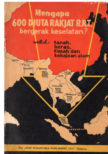
Figure 6. Example of New Nusanantara Publishing product