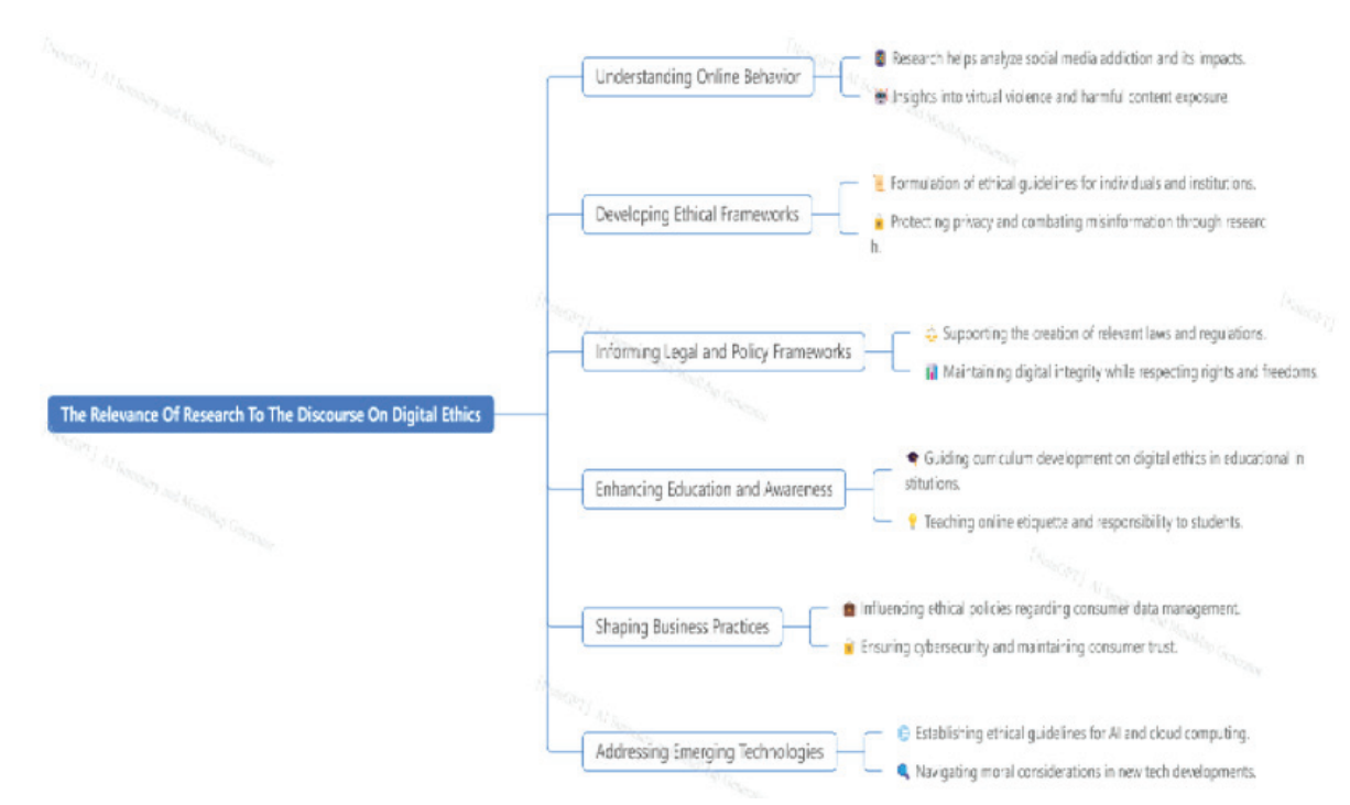
Figure 2. The Relevance Of Research To The Discourse on Digital Ethics

The relevance of research on digital ethics is also related to the development of new technologies, such as artificial intelligence and cloud computing. This research helps