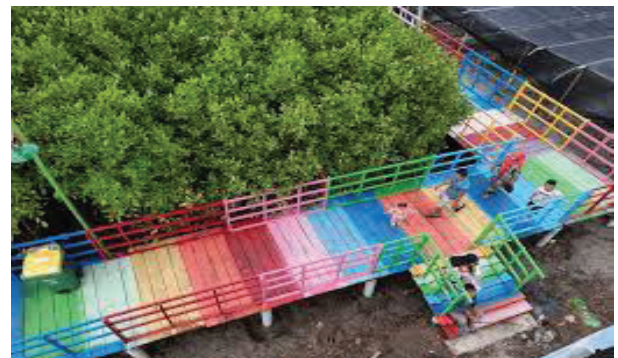
Figure 1. Mangrove Ecotourism in Lontar Village

scale with a choice scale of 1-4. Then the total number of each aspect/criteria is calculated. The total score is interpreted into three categories, namely high with a value range of 81% -100%, medium with a value range of 61% -80%, and low if the value range is \leq 60\% . The data analysis technique in this study is using descriptive qualitative statistics.