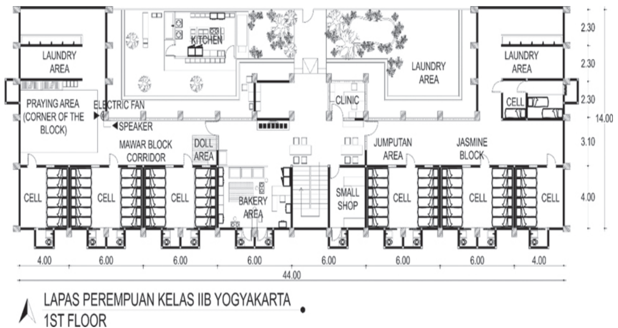
Figure 2 Yogyakarta Class IIB Correctional Facility for Women, 1st Floor Plan