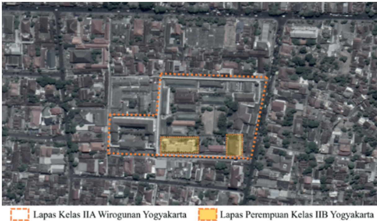
Figure 1 Yogyakarta Class IIB Correctional Facility for Women