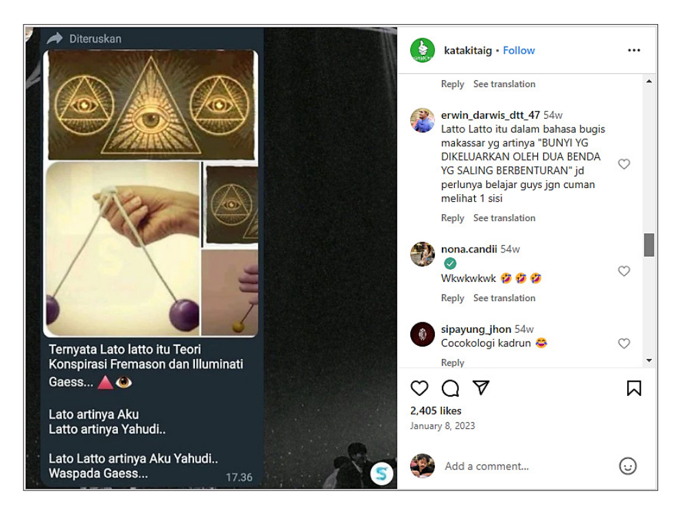
Figure 2. Signifier framing addressed to Lato-Latto.

Mouffe, 1985) that poses a threat to the cultural identity of the group. Recognizing conflict as inherent in society, Laclau and Mouffe (1985) recommend viewing it not as something to be abolished but as a process that can fortify democracy and foster public consensus. Agonistic logic, as emphasized by Mouffe (2005), underlines the need of acknowledging differences and conflicts as integral aspects of the democratic process (see also Uscinski, 2019). However, when constructed as strategic narratives, conflicts can be even more perilous, eroding public trust in the government (Benkler et al., 2018).