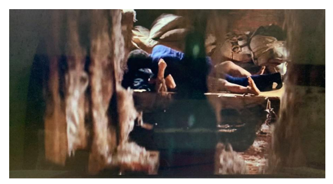
Figure 7. Rape scene (SB, 00.18.41).

All the scenes above were shot from Rudi and his subordinates' gazes. In these scenes, Alisa becomes a sexual object. It is linked with how much power is exercised by Rudi and his subordinates over Alisa. In contrast, Alisa is depicted as powerless and shown in a lying position, and her hands are tied up. Alisa's position, Rudi's gaze, and how the camera is used to film this rape scene can be seen as female sexual objectification. In these three scenes above, the camera always frames Alisa as the object of the gaze. By gazing at Alisa, Rudi and his gang sought sexual gratification. Gazing here functions as an exercise of power. An act of gazing escalates to rape, an act which shows males are more powerful than females and a physical control over females.