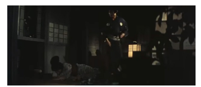
Figure 3. Iemon kicks Oiwa when she begs Iemon to not sell a mosquito net (TYK, 00.22.32).