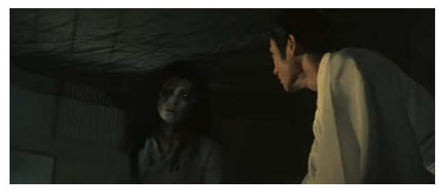
Figure 9. Oiwa haunts Iemon in his room (TYK, 00.54.01).