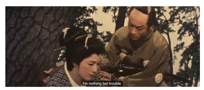
Figure 1. Iemon helps Oiwa who feels tired and unwell while walking (TYK, 00.12.11).

The appearance, dialogue, and external actions of Oiwa and Iemon are contrasting. From the beginning of the movie, Oiwa is depicted as a weak character. It can be seen from how she walks and how she endured a long journey. She needs a lot of rest and walks slowly. Besides being depicted as physically weak, Oiwa is also economically vulnerable and less powerful in her relationship with Iemon. Oiwa. In every scene with Iemon, Oiwa is shown in a sitting position with eyes looking down or in a position lower than Iemon or at the back of Iemon, as shown in Figures 1 to 3 below.