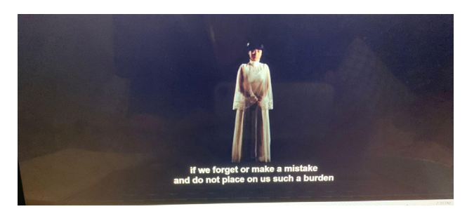
Figure 19. Sundel Bolong becomes calm, and her appearance changes to an elegant lady in a white dress (SB, 1. 40.35).