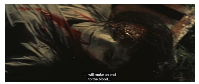
Figure 10. Oiwa haunts Iemon in the river (TYK, 00.58.46).

Oiwa haunts Iemon in a variety of places. She haunts Iemon from the ceiling of his room, she positions herself beside Iemon, and she appears at the river, haunting Iemon from below. We can see the contrast here between Oiwa before becoming a ghost and Oiwa after becoming a ghost. Before Oiwa died, her space was limited. She mostly stayed at home, and if she went out, Iemon accompanied her. Oiwa is also depicted to be positioned behind Iemon or lower than Iemon. But after Oiwa becomes a ghost, she is placed higher or equal with Iemon.