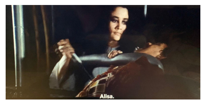
Figure 16. Sundel Bolong kills Rudi, the first of the rapists (SB, 1.39.29).

that raped her. Like Oiwa, Sundel Bolong is positioned higher or on the same level as a man. Sundel Bolong is also depicted as physically strong. She can among other things move a car, make a building crack, and push over a fence. She also eats an enormous amount of food. For example, she ate 200 chicken skewers and one big pot of chicken soup. She also yells at the men who raped her, for example she says to Gadung, "Gadung, sekarang giliranmu kuperkosa" (Gadung, now it's my turn to rape you, SB, 1.05.07) and to Rudi, "Kenapa lari, takut? (Why are you running away? Afraid?, SB, 1.36.29).