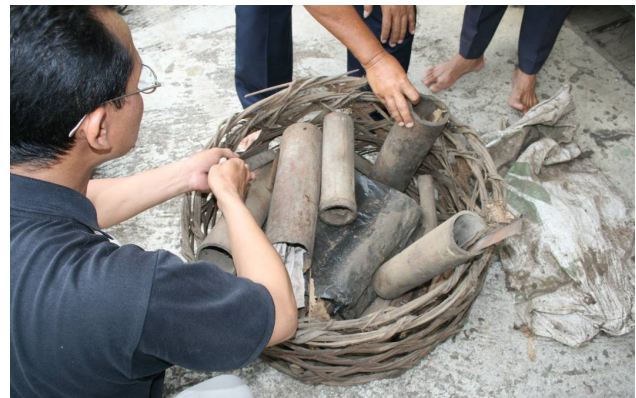
Figure 5. Old Javanese palm leaf manuscripts ( lontar ), inscribed in Old Javanese, stored in bamboo containers, in a straw basket, in Cikadu, Kuningan, West Java, EAP280.

from leather to cardboard, paper and cloth, and digital photographs may also show patterns of stitching of quires, and evidence of traditional repairs to pages. The range of cloths used to wrap manuscripts or as endpapers in volumes is of great interest, and may range from local production such as batik (a fine blue calligraphic batik binding is found on a kitab mawlid manuscript in Ambon, EAP276/7/32) and songket , to imported Indian chintzes and checked cotton sarongs ( kain pelikat ). In an inspiring study, an examination of bindings of Ethiopian manuscripts revealed some of the earliest dateable examples of Indian trade textiles encountered in Africa (Pankhurst 1980), and similar studies of the use of textiles in the bindings of Indonesian manuscripts may also throw up interesting data on the distribution of trade cloths. Traditional methods of storage may also be captured in