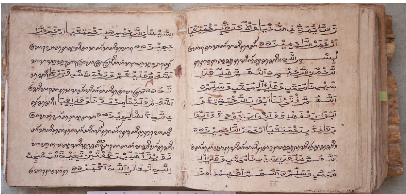
Figure 1. Islamic manuscript containing selections from the Qur'an and prayers, in Cham and Arabic, from Vietnam, 19th c. EAP531/1/2.