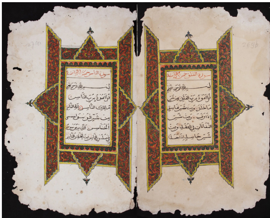
Figure 2. Qur'an manuscript, from Pondok Pesantren Tarbiyya al-Talabah, Keranji, East Java. EAP061/2/35, ff. 269b-270a.

While the role of Arabic certainly needs foregrounding, it should also be acknowledged that at every court and in every madrasah – pesantren , pondok , surau or dayah – Arabic was taught, studied and read in an intellectual environment where other languages were also used and written, such as Acehnese, Minangkabau, Lampung, Sundanese, Javanese, Bugis or Wolio, and in nearly all cases, also Malay. The grouping in libraries of digitised collections in EAP thus also leads on to a consideration of the multilingual context within which the culture of writing flourished in Nusantara. Many of