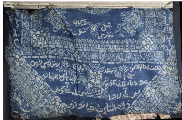
Figure 4. Calligraphic batik cloth binding of a finely illuminated Kitab mawlid manuscript containing verses in Arabic in praise of the Prophet, 19th c., from the collection of Husain Hatuwe, Ambon. EAP276/7/32.

Despite sounding like a contradiction in terms, digitised EAP collections are treasuries of information on manuscripts as material objects, as the photographs usually capture the manuscripts in the form in which they are stored within the communities. Thus a range of materials used as manuscript covers can be seen,