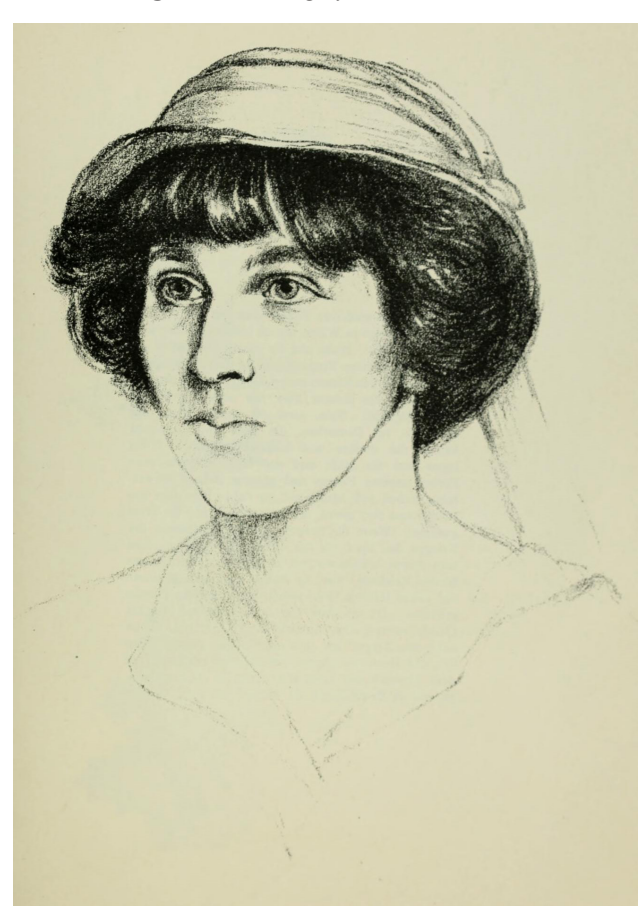
Figure 4. Painting by Hermann Struck