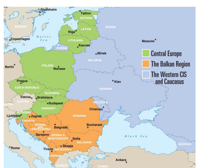
Figure 1. The Map of Eastern Europe.