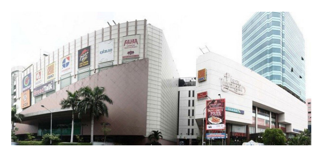
Figure 31. Tunjungan Plaza Phase 1 and 2.

There are several phases on this department store during development. The construction started on 1983 and the first phase of the mall (Tunjungan Plaza