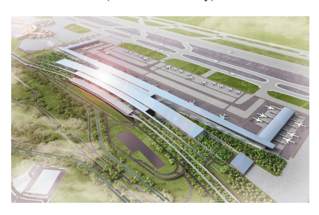
Figure 10. Bird's eye view of Terminal 3 and Terminal 3 Ultimate, Soekarno-Hatta International Airport.

The background of the design itself began on the early construction of the airport itself. The planned shape was to duplicate the previous terminals, still bringing the form and design that heavily influenced by Indonesia's traditional aspects.