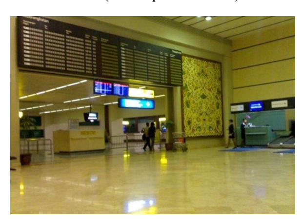
Figure 6. Terminal 2 check-in area with Dayak style reliefs.

There are also details on Picture 6 to 9 that resembles the airport as the gateway of Indonesia. By showing the Indonesian traditional art that differs from the world, so the passengers that will leave or come to the country is feeling the Indonesian influence, feeling differences from their original homeland.