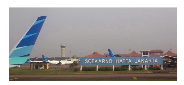
Figure 1. Soekarno Hatta International Airport signage board

Based on the architectural views, there are some changing in airport's design through the phases, due to the advancing technology and recent architectural style. There are two distinct terminals in SHIA that resemble the changing of time and taste in design: Terminal 1 & 2 and Terminal 3 & 3 Ultimate.