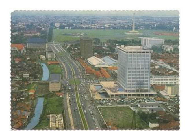
Figure 19. Sarinah Department Store in 1980s (the silver skyscraper on the front), still surrounded by villages that soon to be replaced by new modern buildings and towers.

Mall Taman Anggrek is the most high-end department store in Indonesia. The shopping mall was one of the largest in Southeast Asia when opened in 1996. This mall was built by an infamous conglomerate from Kebumen to respond to the needs of urban society in Jakarta that already expanded. Its largest tenants are department stores, cinemas, luxury shops, and gym.