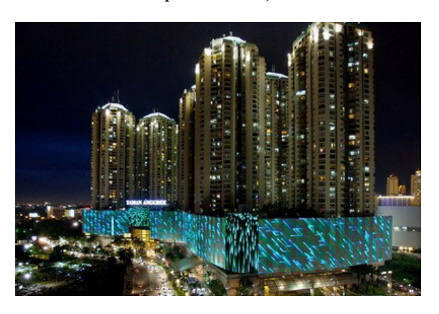
Figure 20. Mall Taman Anggrek at night.

Throughout the complex, there are more than 10 exhibition areas, including a 1000-square-meter center atrium which hosts major events and exhibitions. The mall also boasts Southeast Asia's first indoor ice rink. Taman Anggrek also hosts the world's largest LED display recorded by Guinness World Record.