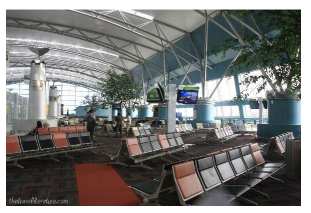
Figure 13. Terminal 3 Phase I airside lounge.

Terminal 3 Phase I was built with the ecofriendly modern design. This reflects on the final form: a low-profile building without minuscule details, like in Terminal 1 and 2. The construction method for this new terminal is still using post and beam for certain structure, but the new method that radically shaped of the new airport is the using of the arch steel frame, made it different with Terminal 1 and 2 that used Java's traditional house philosophy. This new roofing structure then makes the room more spacious, because the supporting beam only located on the side of the building.