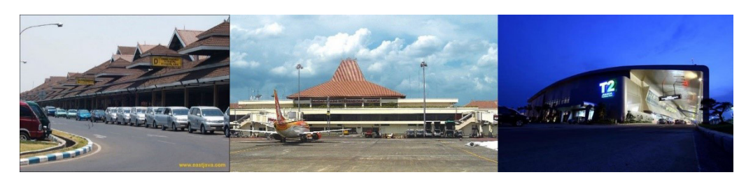
Figure 23. Left - Old terminal, abandoned after Terminal 1 opening, demolished for Terminal 2.; Centre: Terminal 1, inaugurated in 2006.; Right: Terminal 2, built on the site of Old Terminal, opened in 2014

There were studies carried out for the new airport serving Surabaya area, and the land in the district of Sedati in Sidoarjo was chosen to be the new airport took place. The construction phase was started in 1959. In August 1964, the construction was completed and officially inaugurated by Indonesia's first president, Soekarno.