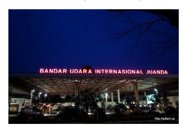
Figure 22. Juanda International Airport signage, Terminal 1.

There were studies carried out for the new airport serving Surabaya area, and the land in the district of Sedati in Sidoarjo was chosen to be the new airport took place. The construction phase was started in 1959. In August 1964, the construction was completed and officially inaugurated by Indonesia's first president, Soekarno.