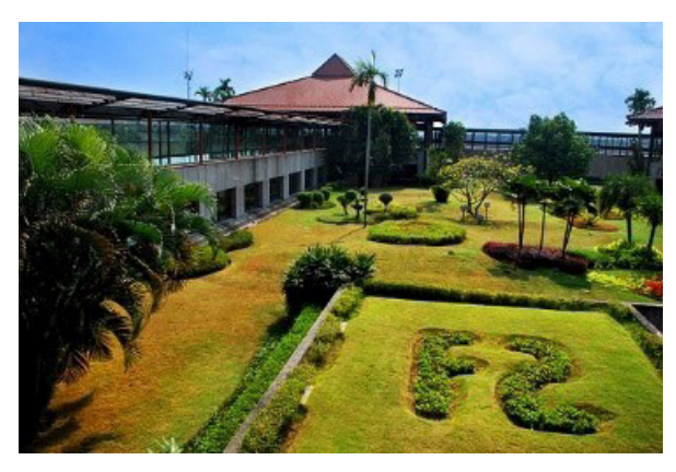
Figure 4. One of the boarding lounge.