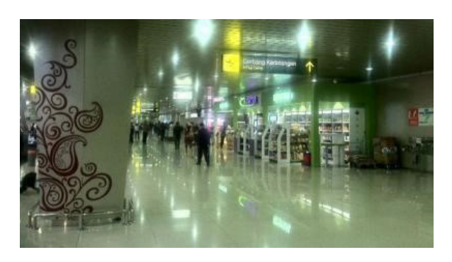
Figure 30. Floral sticker on every post in Terminal 2.

There is almost no detailed ornament, except for the floral sticker on each aluminum-clad post so it does make sense that the budget for this construction is lower than Terminal 1 because of the absence of details and ornament, making this airport looks like any other modern airport in the world with the universal characteristic.