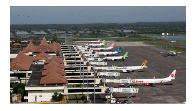
Figure 24. Juanda International Airport Terminal 1.

By the condition of the design movement on that year, it was obvious that the design of a building, even for an airport, became more conventional and functional, starting to leave the characteristic of airport's location. But in this edifice, there are some