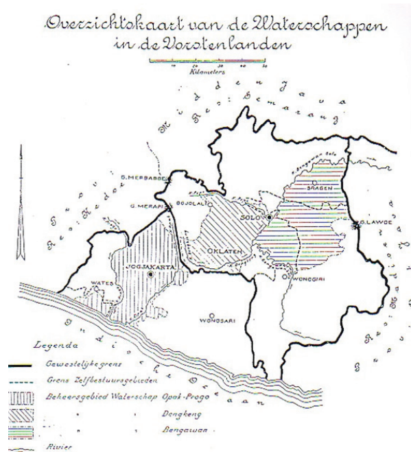
Figure 2 Operational areas of irrigation Institutions in Vorstenlanden

Scope of work area Waterschapp Bengawan measuring 68,000 bau , including the two onderneming . Coverage of exploitation in the north began bordering near the village of Pepe river in Nganti, the border river flow Cemoro up towards the Bengawan Solo. In the eastern part until the Sawur river tipped over Lawu mountain peaks. In the southern part of the border streams start Jlantah river until bridge near Tlobo village until to Jatipuro. At the Eastern start of Baboon river (area Jatipuro) Bengawan river, the Gandul river, the border area south of the river flow Nglumbi in Baderan, until the border Afdeeling of Klaten and Boyolali. In the west to the border of the western part of the Pepe river flow.