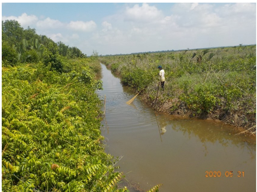
Figure 3. Brackish waters in Banyuasin Regency, South Sumatra, which are the habitat of Bostrychus scalaris .

Habitat. A single specimen collected from a small ditch that irrigated the oil palm plantation area (Figure 3). Measuring width of the ditch about 1.5 m and less than 1 m in depth. The riparian vegetation is dominated by shrub vegetation with muddy bottom. The water source in this ditch flows from a mixture of fresh water at the estuary of the Musi River and salt water in the South China Sea which is directly adjacent to the Bangka Islands with a salinity level of 18.5 ppt (Hernawati et al. 2023).