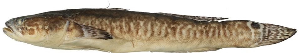
Figure 1. Preserved Bostrychus scalaris specimen, MZB.26591, 103.6 mm SL, collected from Banyuasin Regency, South Sumatra Province, Indonesia.

The dark brown dorsal body extends from the nape to the base of the tail. Ventrally, the dark brown is undistributed and does not completely cover the body, resulting in a pattern of light brown short vertical bars on the lateral body. The light brown short vertical bars number about 24 to 25, forming a ladder-like pattern, extending from the operculum to the base of the tail; some verticals are straight, crooked, and some are wavy. Some ends of the light brown short vertical bars are fused to each other in the centre of the bar, some ends are fused together in the ventral region, and some are separated from each other. At the ends of the vertical bars towards the abdomen and ventral region, the light brown colour fades, leaving small light brown spots along the sides of the body.