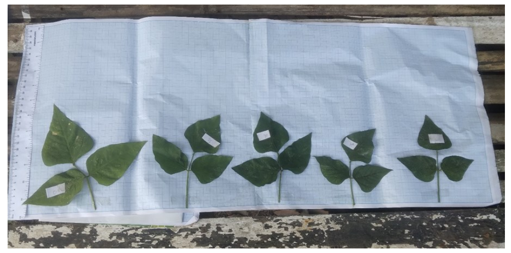
Figure 1. Morphology of winged bean leaves treated with paclobutrazol at various concentration: (a) 0 ppm (b) 25 ppm (c) 50 ppm (d) 75 ppm (e) 100 ppm.

Note: The same letter shows results that are not significantly different in the DMRT test with a significance of 5%.