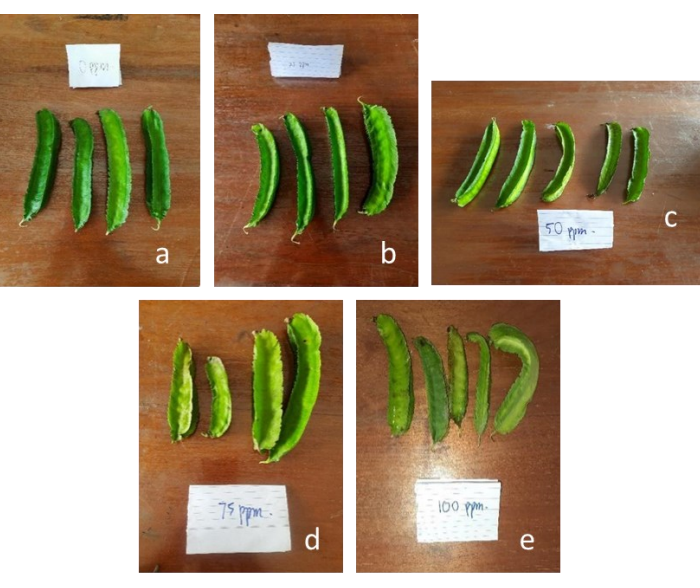
Figure 2. Morphology of winged bean pods treated with paclobutrazol at various concentration: (a) 0 ppm (b) 25 ppm (c) 50 ppm (d) 75 ppm (e) 100 ppm.

Pod length and fruit fresh weight of winged bean plants decreased significantly with increasing application of paclobutrazol concentration according to ANOVA and DMRT test results ( \alpha < 0.05 ) (Table 5).