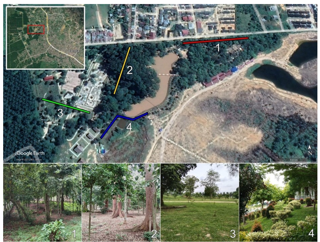
Figure 2. Map of butterfly inventory in LUF (Google Earth software 2021) and photographs of four stations: forested areas (1, 2) and open areas (3, 4).