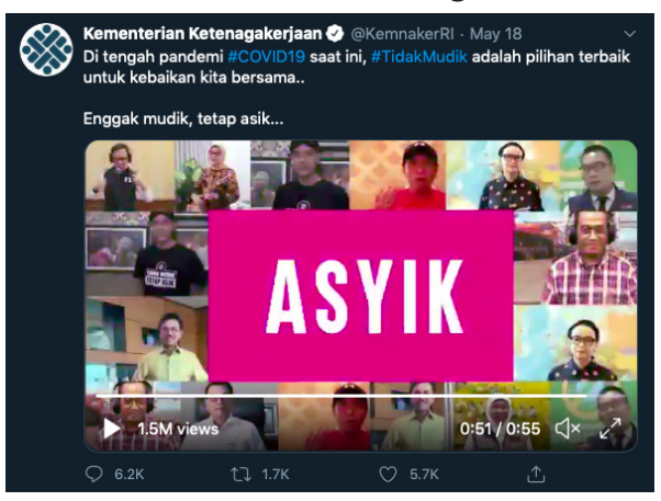
Figure 1. Ministry of Manpower and Transmigration's Prohibition Campaign for Homecoming