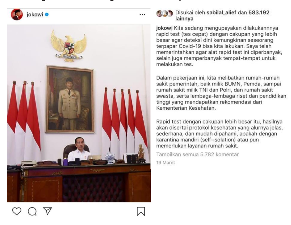
Figure 6. Takarir (caption) of Instagram account @jokowi on March 19th, 2020