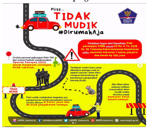
Figure 2. BNPB's Prohibition for Homecoming Campaign