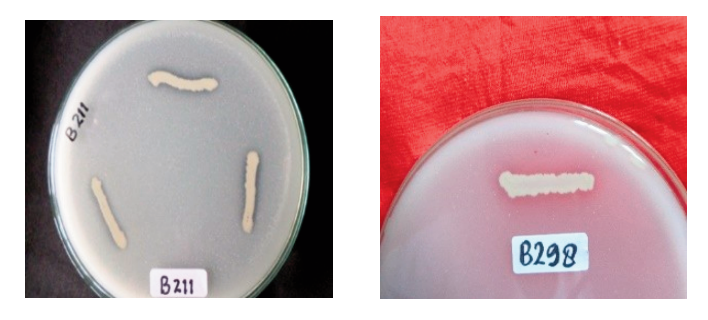
Figure 2. Bacillus subtilis as a phosphate solvent shown by a clear zone formed around the colony of Bacillus subtilis isolates