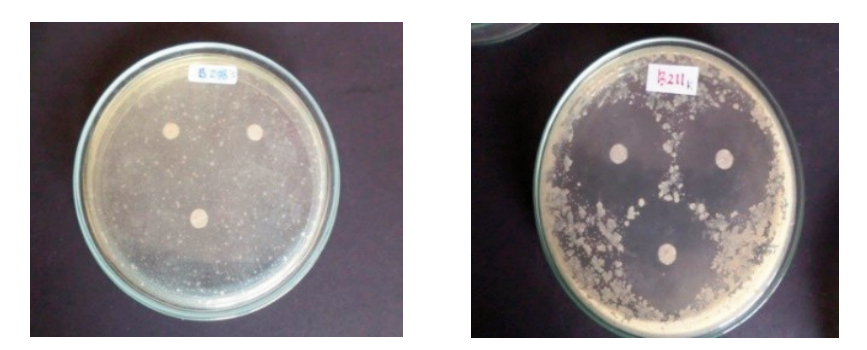
Figure 4. Bacillus subtilis resistance to antibiotics (Rif+) and not resistant to Kanamycin, Streptomycin, and Chloramphenicol