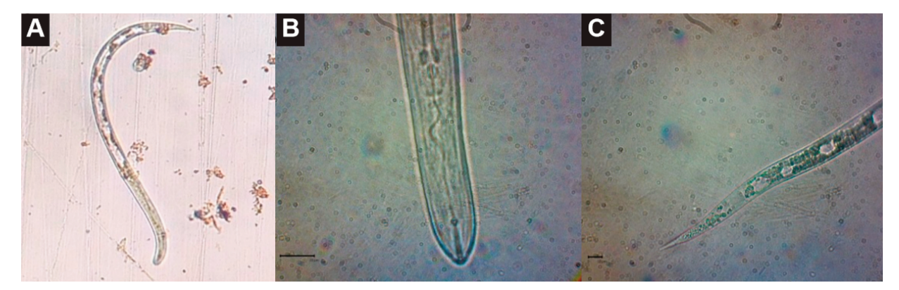
Figure 3. (A) L2 Meloidogyne incognita ; (B) anterior M. incognita (bar size: 10 μm); (C) posterior M. incognita (bar size: 10 μm)