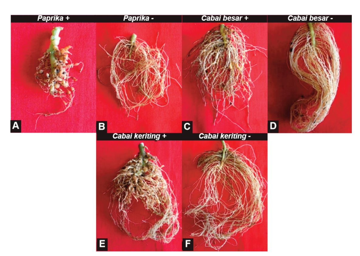
Figure 1. Roots of test plants 60 days after inoculated (DAI); (A) Paprika roots inoculated with Meloidogyne incognita and (B) not inoculated; (C) Cabai besar roots inoculated with Meloidogyne incognita and (D) not inoculated; (E) Cabai keriting roots inoculated with Meloidogyne incognita and (F) not inoculated