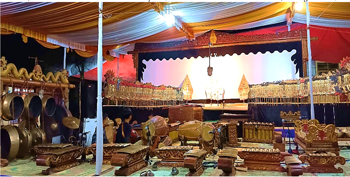
Figure 1 Gamelan, a Material Culture to Produce a Metaphor

Note. This picture was taken before the ceremony began. Unexpectedly, this gamelan brought us to understand the shared reality efforts. The village chief used this object as an allure to socialize the values of unity in diversity