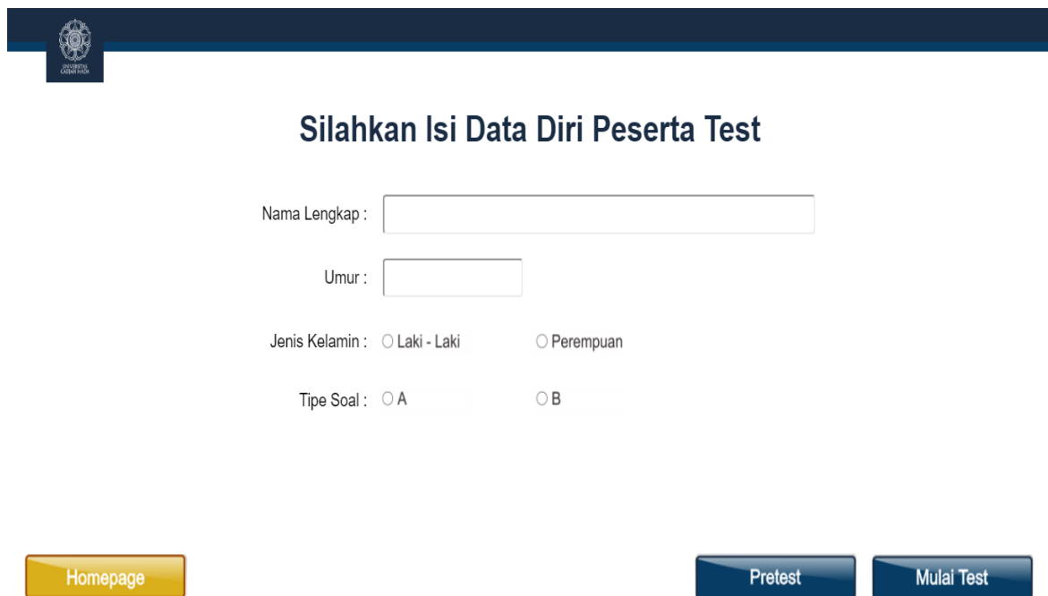
Figure 2. Participant identity page