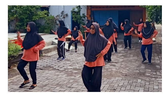
Figure 5. Exercise twice a week along program

checking their fasting blood sugar levels. Diabetes management focuses on key elements: education, strict diet planning, changes in lifestyle, regular physical activity, and behavioral patterns (Ernawati et al., 2021; Mikhael et al., 2020). Committing to regular physical activity is crucial for the prevention and control of diabetes. Regular physical activity aids in weight reduction, lowers blood sugar levels, decreases cholesterol levels, alleviates stress, and enhances insulin sensitivity in body tissues, resulting in reduced blood sugar levels (Mukhtar et al., 2020).