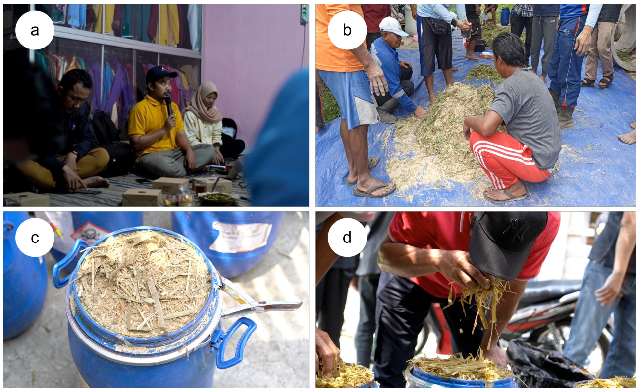
Figure 2 . (a) Feed counseling; (b) FCF production; (c) FCF results after fermentation for 21 days; (d) Feed evaluation

the prepared feed, which was then opened and utilized 21 days after the feed was made (Figure 2 (c)). Legawa (2021) said The feed ingredients used to make fermented complete feed are mixed and then compacted and fermented for 21 days.