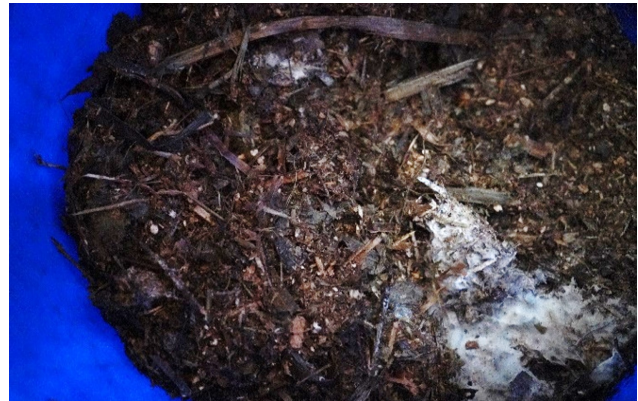
Figure 1. The condition of the fermented feed made by farmers before receiving mentoring

Some farmers had attempted to create fermented feed based on information obtained from social media. Nevertheless, the outcomes could have been more optimal, with issues such as fungal growth and the acidity level of the fermented feed (Figure 1). The lack of farmer knowledge emerged as a factor contributing to the shortcomings in feed production.