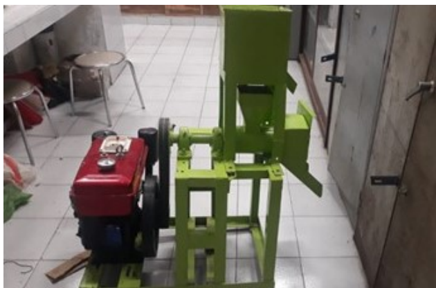
Figure 1 . Fish pellet machine

design for the pellet machine, which utilizes a diesel engine (6 Hp) with a production capacity of up to 50 kg/hour and a dimension of 1640 x 825 x 1100 mm. The design of the pellet-making device can be seen in Figure 1.