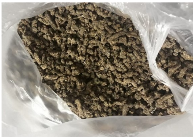
Figure 2 . Fish pellet products

The pellet formulation utilized in this community service project consisted of 20% bran, 20% palm kernel cake, 20% tofu dregs, 20% fish waste, and 20% kiambang ( Pistia stratiotes ). Pellet production commenced with a 2-day fermentation process of the palm kernel cake using EM4 + sugar. Subsequently, all the raw materials were dried and mixed with sago flour as a binder. Finally, the fish pellets were formed using a pelletizing machine. The resulting pellets are tested for nutritional content at the Agricultural Results Analysis Laboratory, Faculty of Fisheries, University of Riau, as shown in Figure 2 and Table 1