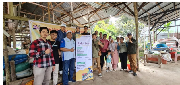
Figure 3 . Fish pellet production knowledge sharing

The third phase involves conducting knowledge sharing on fish pellet production for fish farmers in Merangin Village, Kampar (as shown in Figure 3). In this session, the community service team introduced and explained the process of making fish pellets using natural materials available in the surrounding environment and provides Standard Operating Procedures (SOP) and Work Instructions (WI) to the fish farmers.