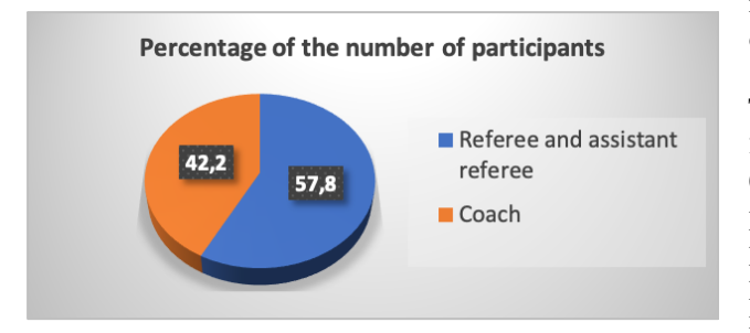
Figure 2. Characteristics of the participants