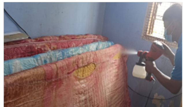
Figure 3 . Cleaning and disinfecting Griya Asih Orphanage's dorm area (December 12 th -16 th , 2022)