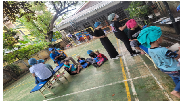
Figure 2 . First head lice eradication activity (October 16 th , 2022) : Permethrin 1% shampoo application for children aged 5-13 y.o.

After the third activity, Universitas Katolik Indonesia Atma Jaya team considered that the efforts in eradicating head lice infestation at Yayasan Griya Asih Orphanage were quite successful, with only one person who required further monitoring. The caretakers and other older residents at