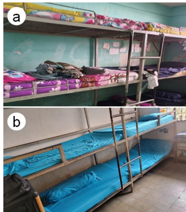
Figure 1 . Bed arrangements in Yayasan Griya Asih Orphanage: (a) Initial condition; (b) Current condition

This situation prompted us to organize community service activities to eradicate head lice from Yayasan Griya Asih Orphanage to improve the health and well-being of all residents. The ultimate goal of these community service activities was to eradicate head lice infestation at Yayasan Griya Asih Orphanage.