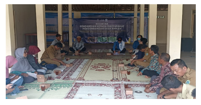
Figure {\bf 8} . Monitoring and evaluation with the Gapoktan Sembada Pacacejo

The number of Indigofera plants that have been planted on the available planting land had not been achieved because 1) there were still a large number of human resources from members of the farmer groups in each hamlet who had not carried out nurseries, so the achievement of Indigofera plant seeds had not been implemented and 2) the cohesiveness of the farmer group members under the auspices of Gapoktan Sembada Pacarejo was still being determined, so the land clearing had not yet been implemented. In accordance with this, the benefits of Indigofera planting would be maximized and effective if all members of the Gapoktan group could support and carry it out collectively (Sandyatama & Hariadi, 2012). In order for Gapoktan Sembada Pacarejo and the residents of Pacarejo Village to achieve the use value and economic value, it is necessary, based on the program evaluation as seen on Figure 8, to incorporate a sustainable design into the previously proposed community service roadmap.