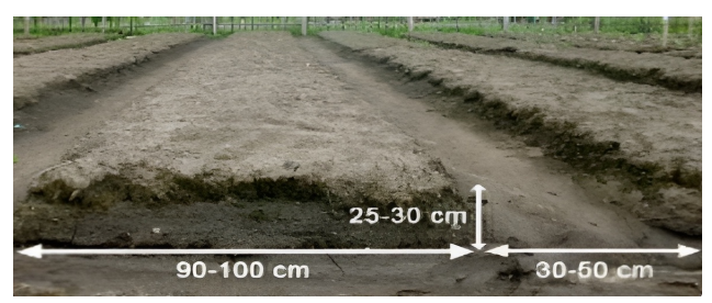
Figure 3 . Matrix for planting Indigofera plants

a negative impact on the environment. Therefore, there is a need for the support and commitment of the community, both farmers and academics, to develop appropriate technology to support the cultivation of Indigofera to produce superior varieties. The superior varieties expected for Indigofera as dyes are certified seeds, easy to plant under various stresses, and highly productive (Muzayyinah, 2014).