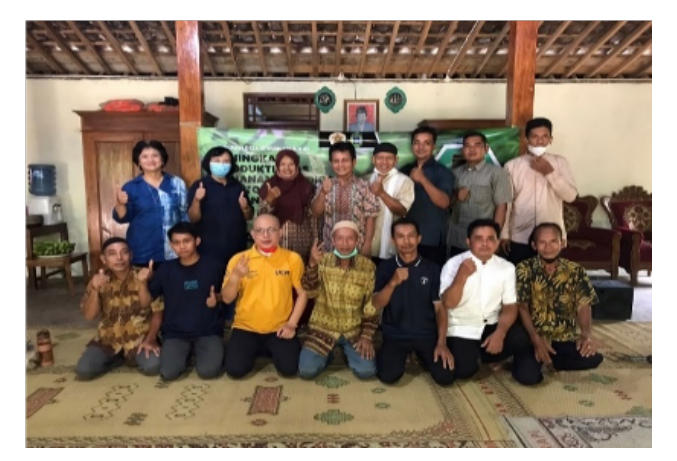
Figure 2 . Location agreement for Indigofera Tinctoria planting Area: Gapoktan Sembada of Pacarejo community photo

Plant cultivation activities, especially Indigofera plants, are a shared responsibility of the Indonesian people. This is an effort to preserve and prevent the scarcity of these plants, as it is known that currently, the need for dyes in the textile industry is dominated by artificial dyes, which have