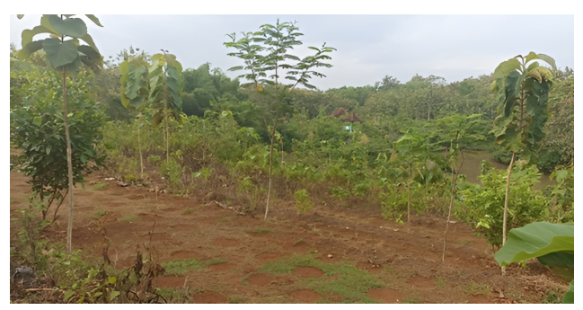
Figure 4. Location of Indigofera Tinctoria L. planting land