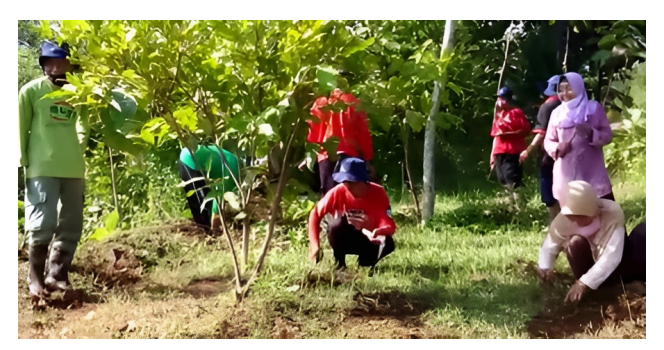
Figure 5. Land clearing activities development of distance planting system and seeding

wilting. Plants need to be watered with enough water (Dewi et al., 2022).