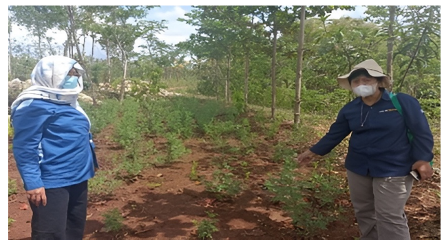
Figure 7 . Indigofera Planting land

At this stage, the Indigofera tinctoria planting area was monitored. The three hectares of land promised by Gapoktan had been fulfilled, and Indigofera Tinctoria seeds have been planted, as portrayed in Figure 7. However, it was discovered that some Indigofera plants had not been appropriately watered; this was because the irrigation system had not run optimally or was still conventional. According to Muzzazinah et al. (2022), using a sprinkler irrigation system further expands the watering area so all trees can be adequately watered. A sprinkler irrigation system can efficiently use irrigation water, and the uniformity of irrigation provided can be more than 85%. The hope is that a sprinkler irrigation system can be applied in the next period of community service activities. After the monitoring activity occurs, the next activity stage can be carried out, namely evaluating the progress of planting Indigofera (Muzzazinah et al., 2022).