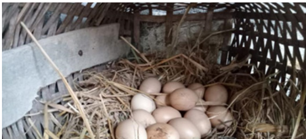
Figure 2. Eggs produced by jawa super (joper) hen

Jawa super (joper) chicken as the result of hybridization between layer hen and bangkok rooster, is enable to produce eggs around 20-25 eggs/hen/month. Eggs produced by jawa super (joper) hen have an in-between characteristic and measurement eggs produced by layer hen and kampong hen. For example, jawa super hen's egg has a dominantly light brown color (Figure 2.), whereas layer egg color is brown and kampong egg color is white. Furthermore, the size of jawa super hen egg is medium size in-between the layer and kampong egg. The weight of jawa super hen's egg is around 55.684 g, whereas the weight of layer and kampong chicken's egg are around 66.918 g and 53.440 g, respectively.