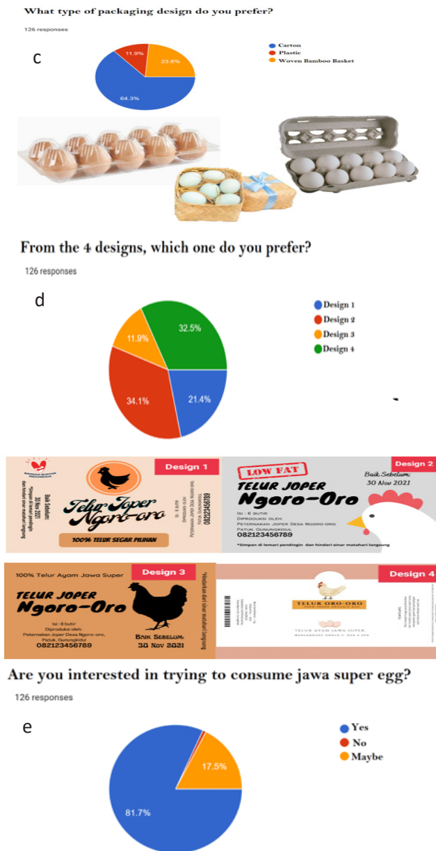
Figure 4. Consumer egg preference survey: egg color (a), size (b), packaging design (c), label design (d), and interest in trying Jawa super chicken egg (e)

Some studies reported that there are a lot of factors which must be analysed to support the success of egg trading. Syafriardi and Iskandar (2006) stated that the local farmer usually faced difficulties to fulfil the demand and has no standard price. Besides, they also faced some threats such as price fluctuation, no subsidy from the government, and competitor. Widyantara and Ardani (2017) reported that the inefficient of egg production as well as low promotion of the chicken farming also cause the reduction of eggs trading in local farmer. In this program, we understand that the promotion is one of the most important part for marketing, thus developing simple and elegant designed may attract the consumer to buy the Jawa super eggs. Besides, the increasing of society awareness on nutrient requirement cause increasing eggs demand (Widyantara and Ardani, 2017). Sugiharto (2008) and Pinto, Hapsari, and Hartadi (2016) stated that smooth distribution from the farmer to consumer