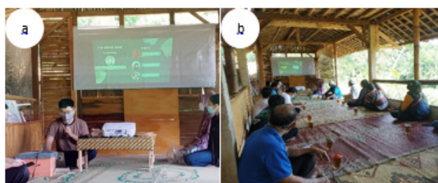
Figure 3. Post-harvesting management of jawa super chicken eggs' training presentation (a) attended by the villagers (b)

Indonesians have the perception that kampong eggs possess better nutritional value than layer chicken eggs. Some reasons why not everyone can consume kampong hen eggs is because of their higher price and low productivity compared to layer chicken eggs. Hence, for convenience, price, and availability, most people prefer layer chicken eggs for daily consumption. Now, with the higher performance of jawa super (joper) hen to produce egg and closer characteristics to kampong chicken eggs, the jawa super chicken eggs may have potency to become another egg preference among the people. Hence, before plunging into the market, the villagers need to have a brand, packaging, and promotion strategy. The training in post-harvesting management aimed to educate the villagers about good packaging designs, the importance of a brand, and promotion strategy (Figure 3.). We gave some examples about the type of packaging, several designs of labelling, and promotion strategy. Promotion and marketing strategies can be done such as selling the jawa super chicken eggs first to the local supermarket then if in a week some of them weren't sold, they can distribute those eggs to traditional market and sell them with lower price, besides also do promotion through social media to increase the exposure of the product to the consumer and increase the marketing aspect as well.