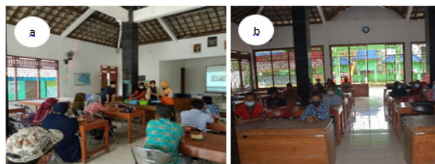
Figure 1. Villagers were paying attention on the training of making the alternative chicken feed from black soldier larvae's demonstration (a) and presentation (b)

Appropriate and optimal feed intake is important to increase chicken productivity. Previous study by Mulyono and Purnomo (2013) reported that a mixture of concentrate, milled corn, and rice bran with a ration 1:2:2 suitable for Jawa chicken feed. Moreover, Najib et al. (2014) reported that supplementation of corn oil and linoleic acid increased egg size and weight. In some countries, black soldier fly larvae already developed as an alternative feed for laying hens because contain high protein and fat around 35 and 30%, respectively (Dortmans, Diener, Verstappen, & Zurbrugg, 2017).