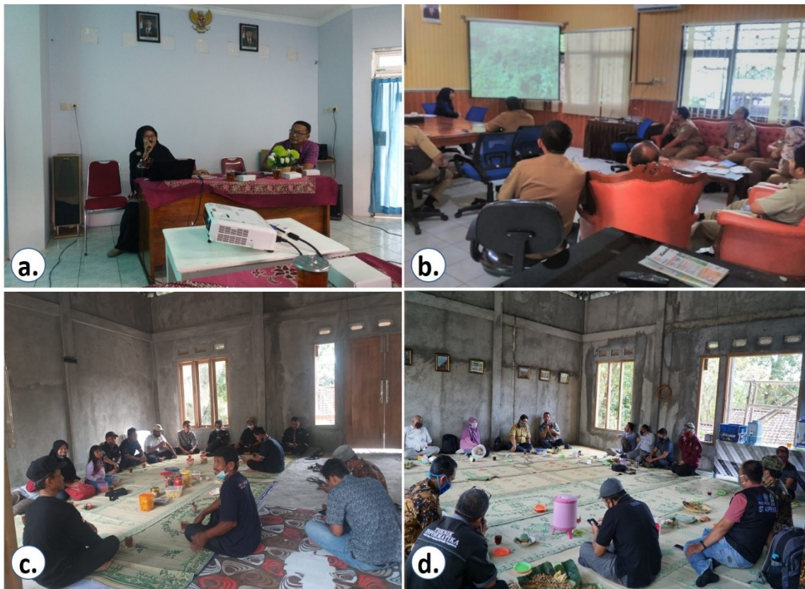
Figure 2. a) Presenting the results of research into the local government (May, 2019); b) Discussing the geotourism development with the Regional Research, Planning and Development Agency of Gunungkidul Regency (Juni 2019); c) Discussing the geotourism plan with the local community (June 2019); and d) Discussing the geotourism progress with the stakeholders and the local government (June 2021).

(Figure 2.c). The progress of Gunung Ireng is evaluated every Sunday night to explore the obstacles faced and brainstorm the best solution. (Figure 2.d). Organizational strengthening (POKDARWIS) is always monitored effectively, followed by planning activities in line with the vision, mission, and objectives of the Gunung Ireng Geotourism.