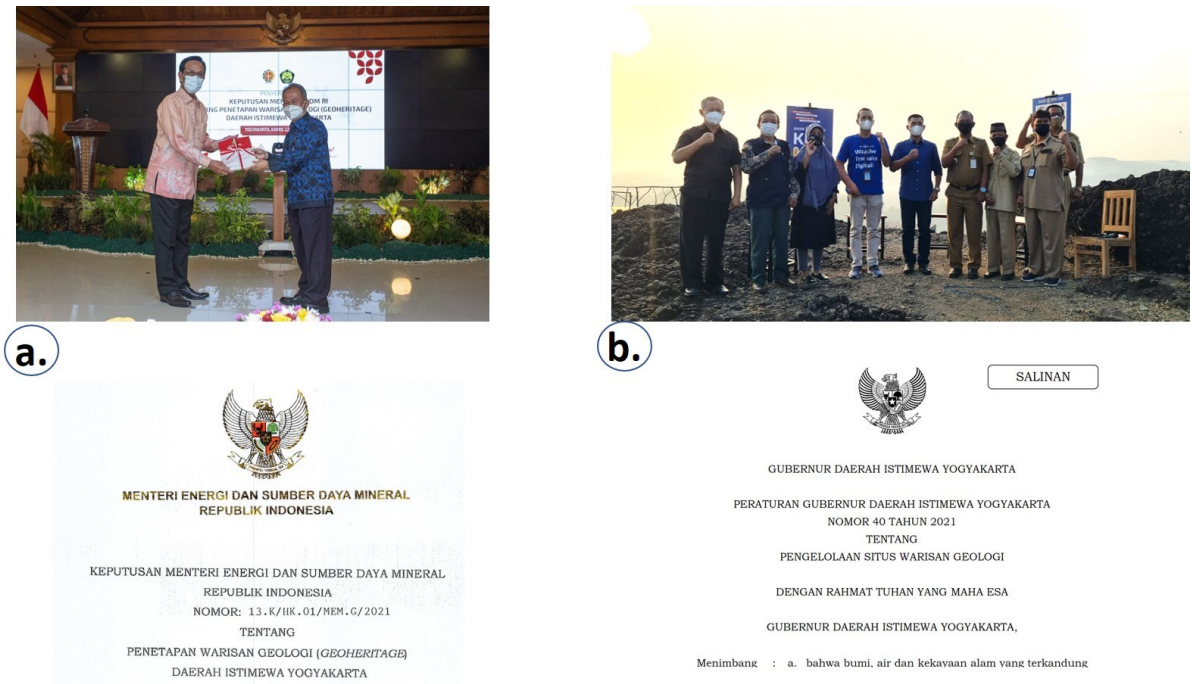
Figure 3. a. The Submission of Decree of the Minister of Energy and Mineral Resources Number 13 K.HK.01.MEM.G.2021 regarding the annihilation of 20 Geoheritage Sites in DI Yogyakarta by the Head of the Geological Agency to the Governor of DIY on 22 April 2021 (ESDM, 2021) and a copy of the decree; b) Pledge of commitment by the Gunungkidul Regent and the Head of the Gunungkidul BPD Bank in their commitment to maintaining and implementing the DIY governor's regulations regarding the use of geoheritage areas, one of which is Gunung Ireng and a copy of the governor's regulation No. 40 year 2021