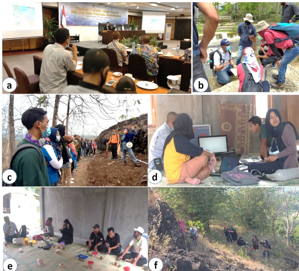
Figure 6. a) Classroom on geotourism guidance training (photo on October 2019); b) Training on interpretation techniques (photo on October 2020); c) Intensive training on fieldwork guidance (photo on October 2021); d) Training on website and operating system (photo on May 2021); e) Motivation and mentoring on networking (photo on July 2021); f) Training on Photography (photo taken on May 2021)