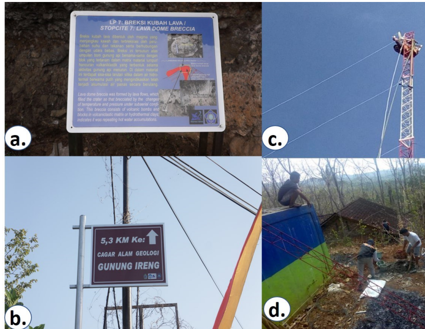
Figure 5. a) An example of a signboard installed at the Ancient Volcanic Museum (June 2021); b) The directional signboard (June 2021); c) Unlimited Microtik Wi-Fi (October 2019); d) Cultural signboard installation (October 2021)

access from various surrounding destinations, from Patuk District to the location. The Regent of Gunungkidul is highly committed to the sustainability of this community service activity. The implementation of the Corporate Social Responsibility (CSR) program from the Regional Government Bank (BPD) of the