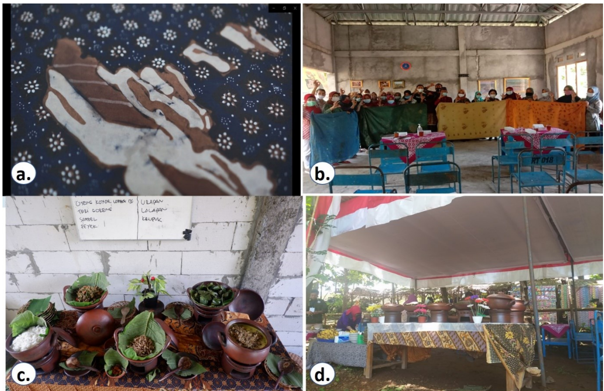
Figure 4. Some of the amenities that have been successfully added during the activity: a) The aesthetic Gunung Ireng's batik developed using local andesitic thin section motif (photo taken in 2019); b) The batik's implementation (photo taken in April 2021); c) Various menus that available at Gunung Ireng (photo taken on 2020, 9 January); d) Cafes and restaurants by order (photo taken on 2020, 10 March)

issued by the Ministry of Energy and Mineral Resources Number 13 K.HK.01.MEM.G.2021 (Figure 3.a), which is then followed up with the Regulation of the Governor of the Special Region of Yogyakarta