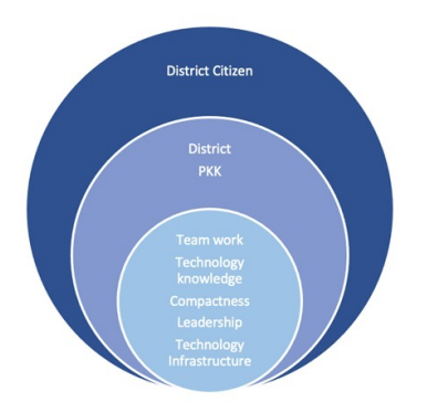
Figure 2. Community asset mapping

From the interviews with the representatives of smallmedium business owners and village office staff, we discovered several assets, including their potentials and opportunities. For example, there were small-medium businesses run by the PKK women and there were parcels of land that could be utilized for agriculture. These assets were then mapped according to their territories and the types before being analyzed using the leaky bucket. The mapping is shown in Figure 2.