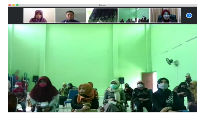
Figure 3 . Documentation of e-commerce workshop

The training was delivered in accordance with the needs of the PKK women in Purwodadi Village. During this pandemic, a training that could give motivation for the PKK women and increase their creativity using technology could become a solution to strengthen the families' economy. The government of Malang applied large-scale social distancing which directly affected these PKK women who were mostly business owners. The PKK women in Purwodadi Village (around 80% of the feedback in postest) said that the training had helped them because they became able to sell their products (around 86%) through online platforms such as Lazada and Shopee even in the middle of large-scale social distancing.