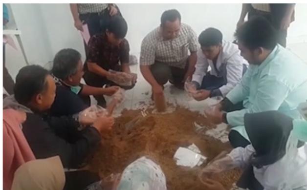
Figure 1. Mushroom Cultivation Training Activities

These activities are shown in the image below. It was hoped that after the extension and training sessions, the participants would be able to implement the learn methods, so that they could increase the productivity of oyster mushrooms in Tasikmalaya. After these sessions were completed, this community service program continued with carrying out a business feasibility analysis for the Ganda Mandiri Farmer Group.