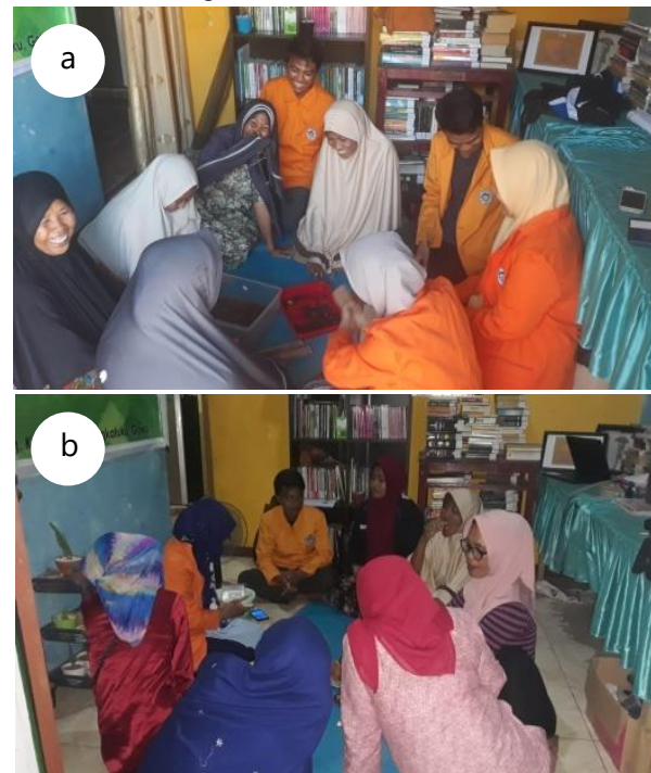
Figure 2. Training during program implementation: (a) Cultivation of black soldier flies; (b) Making of fermentation fluids and processing black soldier flies into fish feed

The training was held twice at the house of one of the partners with training material I on how to cultivate black soldier flies (Figure 2.A) and training material II on how to make fermentation liquid and process black