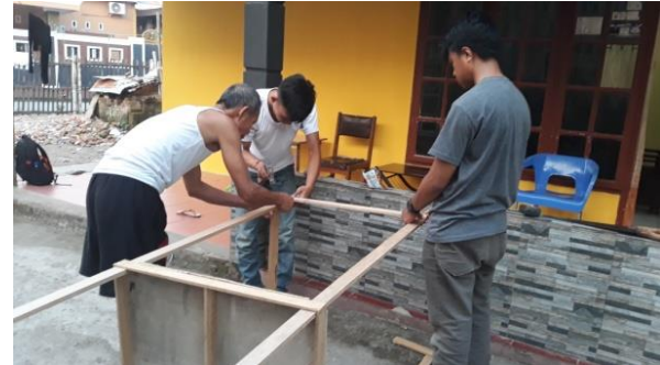
Figure 1. The making of black soldier fly cage

The provision of tools and materials was done by creating a black soldier fly cage and a place for them to lay their eggs using smoothed wood, iron nets, nails, hammers, covers, rubber bands, basins, and water shown in Figure 1. In addition, equipment and other things used for training were also prepared, such as training sites, mats and a collection of pictures related to how to cultivate the army flies and how to process the larvae (maggots) into fish feed.