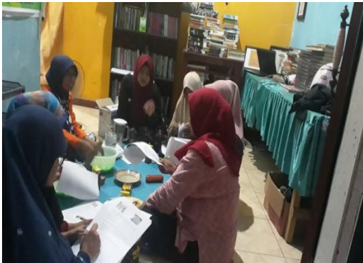
Figure 3. Pre-test and post-test implementation

The monitoring stage was carried out to monitor and see the progress of the partner group's performance that had been formed previously. The activities carried out were maintaining fly larvae (maggots) by feeding them with organic waste twice their body weight every day and transferred them to a cage after they became pupae, harvesting fly eggs, and processing pupae and dead flies.