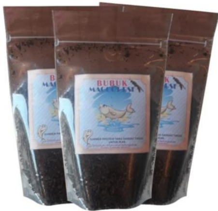
Figure 5. Fish feed products

applications. The fish feed products can be seen in Figure 5.