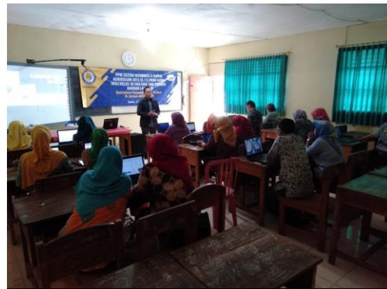
Figure 2. When Exposing the e-Rapor-based Information System Material

The process of providing material to teachers at the SMA/SMK Persada Lampung is carried out in class. All the teachers were enthusiastic about participating in the training activities. Even though schools do not have adequate facilities for conducting e-Rapor information system training, teachers are willing to bring their equipment. As shown in Figure 2, teachers actively participate in e-Rapor information system training activities. They use devices that they carry themselves, namely laptops. Their enthusiasm was also shown with a high curiosity through the questions raised.