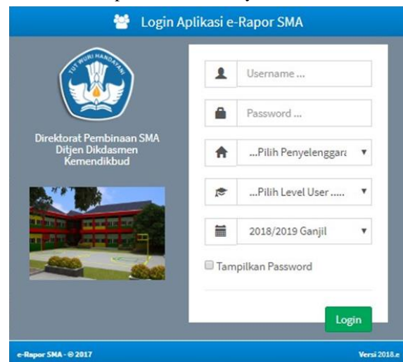
Figure 1. Log in page of e-rapor information system.

The opening activity was carried out by M. Dwiyan Aditya, M.Pd. This activity was carried out to discuss the agenda which included the training activities and technical guidance on the use of e-Rapor information systems (Figure 1). This training was carried out through several stages i.e., namely training on the use of e-Rapor information systems from which the users became the operator. This training for classroom teachers, counseling teachers, and students were expected to bring information and guidance to access the e-Rapor information system