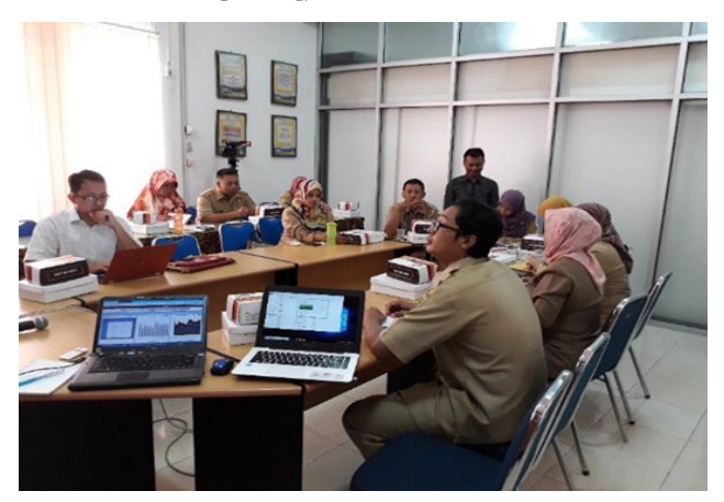
Figure 2. Workshop on Data Availability in Bantul District Health Office

The workshop was held on 9 July 2018 in Hall C of the Sleman District Health Office. The workshop was attended by 15 staff from the health service office and two representatives from the Puskesmas in the Sleman area. The available health program reports Include Health Human Resources (Sumber Daya Manusia Kesehatan [SDMK]), Health Promotion (Promosi Kesehatan [PROMKES]), Clean and Healthy Living program (Perilaku Hidup Bersih dan Sehat [PHBS]), mental health, KESGA, and health Data sources available from the Bantul Health Office included immunization, maternal and child health (Pemantauan Wilayah Setempat-Kesehatan Ibu dan Anak [PWS-KIA]), Acute Respiratory Illness (Infeksi Saluran Pernafasan Akut [ISPA]), and diarrhoea.