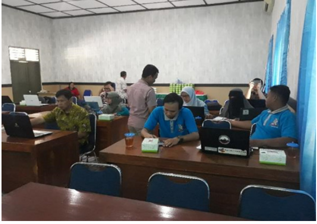
Figure 4. Workshop on Data Availability in Gunungkidul District Health Office

In addition, it was found that several of the same dataset have different formats of spreadsheets amongst district health offices. It had an impact on the quality of data and the method of integrating data from multiple health programs from multiple health offices. Integration of data into a data warehouse such as DHIS2 without intervening existing data collection tools is perceived as a strategy to identify all public health data and strengthen health management information systems. However, there are many nontechnical issues that hinder the use of DHIS2 such as political, cultural, social and structural infrastructure and human resource (Dehnavieh et al., 2019). For example the systems was seen as another burden of data entry among health staff event though the data was imported from existing systems.