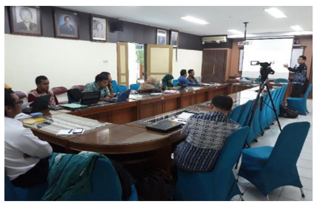
Figure 1. Workshop on Data Availability at Provincial Level

The workshop was held on 18 May 2018 in Hall A of the Yogyakarta Special Region Health Office. The workshop was opened by the head of health services and attended by several health program managers in Yogyakarta Special Region Health Office and Health Information System (HIS) staff representatives from the district health offices in Yogyakarta Special Region. There were two types of data collection method, namely spreadsheet and electronic data capture as web-based applications. Program-based data with spreadsheet format that available included Human Resource for Health (HRH), morbidity data from puskesmas and hospitals, nutrition, and MCH. Meanwhile, the available electronic information system included an integrated Immunization Information System (Sistem Informasi Imunisasi Terpadu [SIMUNDU]), an Integrated Disease Surveillance System (Surveilans Terpadu Penyakit [e-STP]) and Family Health (Kesehatan Keluarga [KESGA]).