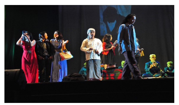
Figure 4 Performance of Gending Karesmen Nyiar Luang Tina Cianjuran at GK. Sunan Ambu, ISBI Bandung

This approach is in line with global practices in traditional performing arts. Kathakali dance in India has been updated with modern visuals, and Noh theatre in Japan has used multimedia projections. These are two examples of how technology can bring new life to traditional arts without changing their cultural essence (Menon et al., 2024; Rockell, 2023). These technological innovations in performance have proven effective in attracting new audiences, especially among the younger generation who are more familiar with digital technology. The integration of modern elements helps bridge the gap between tradition and modernity, thus increasing the relevance and appeal of Tembang Sunda Cianjuran.