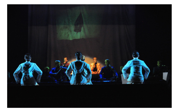
Figure 2 The opening segment of Nyiar Luang Tina Cianjuran is conventionally presented. This initial staging establishes the foundation that later becomes the starting point for innovative reinterpretations.

Arif Budiman, Negotiating Tradition and Modernity: The Dialectics of Conservatism and Progressivism in Tembang Sunda Nyiar Luang Tina Cianjuran