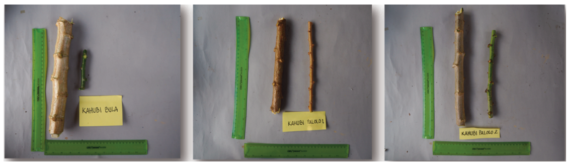
Figure 1. Stem color of the three accessions Kahubi Bula, Kahubi Palolo 1, and Kahubi Palolo 2