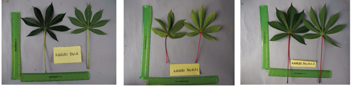
Figure 2. Appearance of leaf characteristics of the three cassava accessions

The leaf morphology of the three accessions differed, with the exception of the characteristics of pubescence on immature leaves and the angle of the petiole to the stem. The lobe shapes from three accessions are lanceolate for Kahubi Bula, elliptical for Kahubi Paololo 1, and lanceolate for Kahubi Palolo 2. The immature leaves of Kahubi Bula and Palolo 1 have the same light olive color, whereas Palolo 2 has a moderate yellow-green coloration. The coloration of the top segment of the petiole at the apex of the stem for the three distinct accessions is as followes: red and silver-green for Kahubi Bula, strong red for Palolo 1, and strong purplish red for Palolo 2 (Figure 2, Table 3). Despite their variations, the accessions have