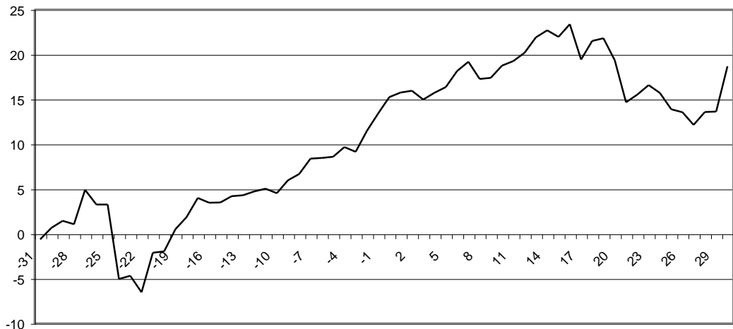
Figure 1. Cumulative Abnormal Return during Announcement Periods

Descriptive statistics of cumulative returns during the event periods (day -14 to day -1) shows that domestic investors account for a much larger price movements than foreign investors; domestic investors account for about 186% versus 0.2% for foreign investors, or about 100% of total price movement if we convert into proportion. While the difference between domestic and foreign investors seems to be obvious, statistical tests do not show any significance at conventional level. The small sample seems to drive such insignificance.