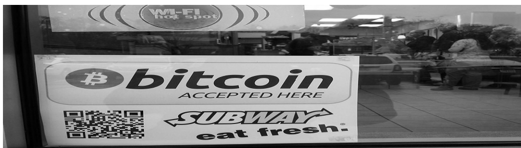
Figure 2 American Subway Sandwich Accept Bitcoin Payment

Bitcoin was the first cryptocurrency that started to circulate in society in 2009. Before bitcoin started to be used in society, e-payment systems already existed to make online transactions easier. Before making an e-payment, the users should transfer the amount of money they need, then the physical money will