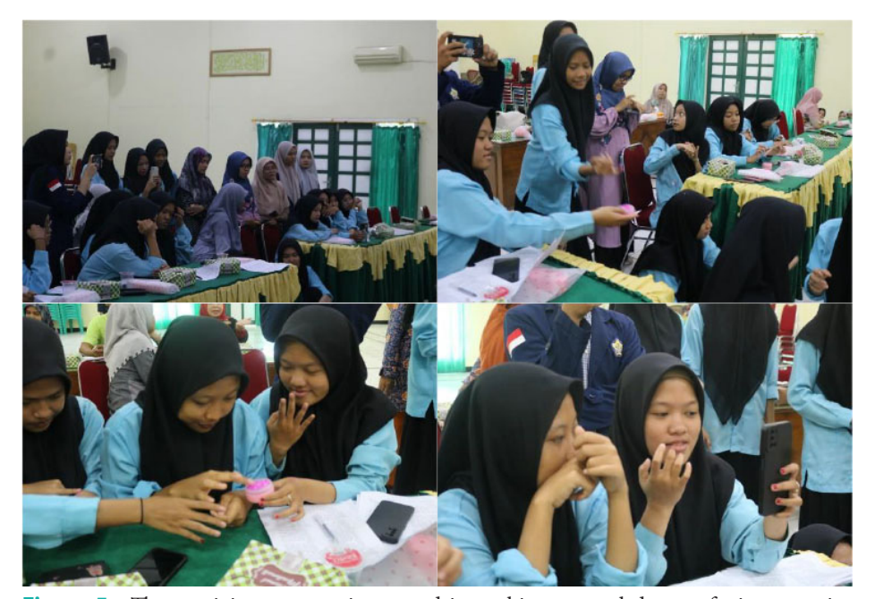
Figure 5. The participants were interested in making natural dragon fruit cosmetics and products from their own handmade.

which contains anthocyanin compounds known for their antioxidant properties (Figure 2b). The various materials and tools used were demonstrated visually, with the instructor showing the form and function of each item (Figure 2c). The female students were encouraged to observe while the faculty members demonstrated the lip tint and cream blush preparation techniques. At the end of the preparation demonstration, the instructors showcased the packaging process in the respective containers (Figure 2d).