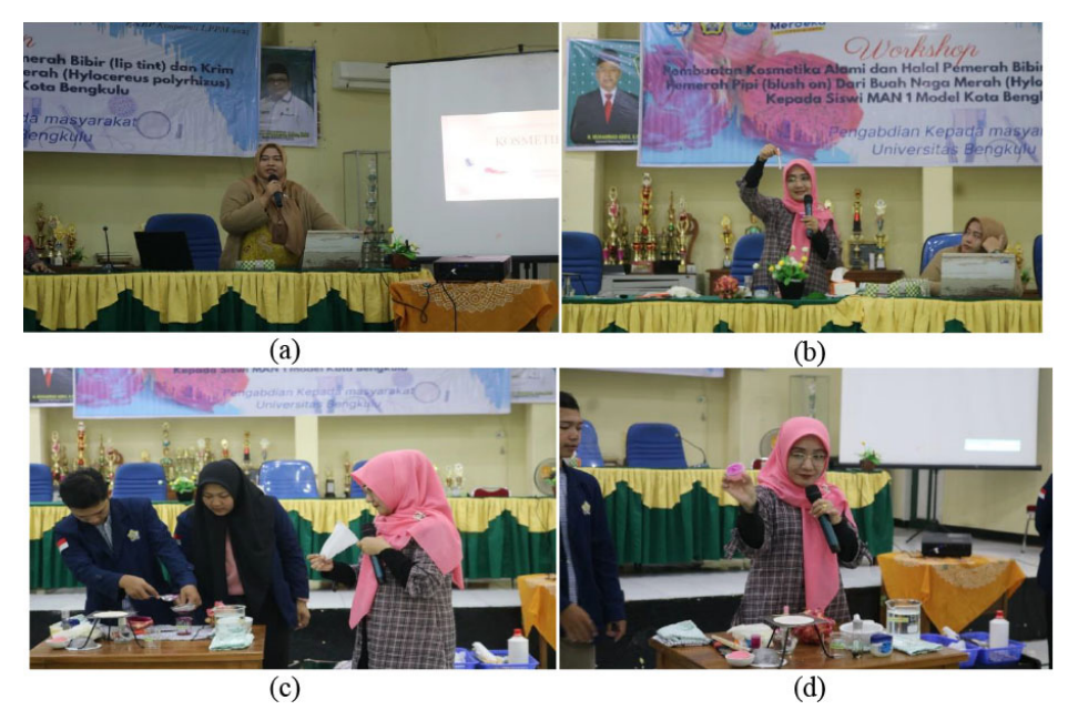
Figure 2. Demonstration of Crafting Cosmetics. (a) Education about illegal cosmetics by a doctor. (b) Explanation of the benefits of red dragon fruit. (c) Demonstrate how to create lip tint and blush on dragon fruit. (d) Pharmacists showcased the packaging process in the respective containers.