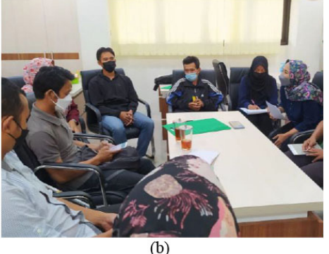
Figure 2. Focus Group Discussion (FGD). (a) FGD Group A. (b) FGD Group B.