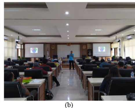
Figure 1. Integrated Training Program. (a) Pre-Test. (b) Delivery of topic from an

Knowledge was assessed before and after the training using questionnaires that consisted of multiple-choice questions